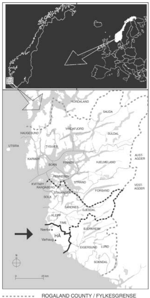
JÆREN REGION / REGIONGRENSE HÅ MUNICIPALITY / KOMMUNEGRENSE HÅ municipality (Lillehammer 2005:13, Fig. 1).

In representing an in-between relationship of landscape perception, conflict is a situation of sharp disagreement or collision in interests between people or institutions whose objectives clash (Guralnik 1976:298). In the rural district of Jæren, Rogaland County, South-western Norway (Fig. 1), the protection of archaeological heritage and cultural environments surrounding it is met with hard conflicts from intensive cultivation, in particular the 'utmark' environment in the agrarian landscape. The examination of these conflicts in the landscape requires the applications of specific approaches, theories and methods. In analysing dissonance between interests in resource managements, it is necessary to review the complexity of the situation, and to single out mutual and contradictive factors at heart of the disagreements.