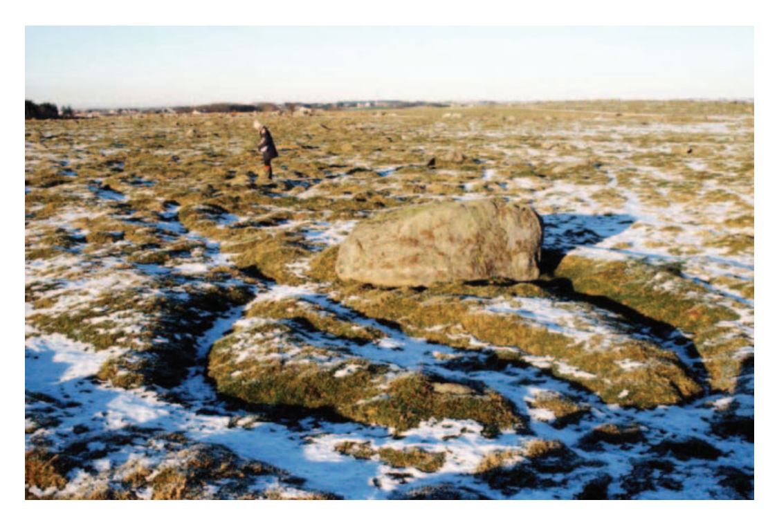
Fig. 3. Earthwork of 'fairy-ring', the relic of a ditched haystack base. Original distribution was alongside wet heaths and mires in the outfield and wetland environments (Lillehammer 2005:103, Fig. 3b).

The interdisciplinary result from the case study of 'fairy-rings' in Hå municipality, South Jæren, indicates the earthworks to occur in the pastures together with clearance cairns in the Iron Age (Fig. 3). The excavations of the 'fairy-rings' yielded dates at the earliest to the end of Migration Age (cal. AD 410-450) and at locations together with clearance cairns to late Iron Age (cal. AD 670-900) (Prøsch-Danielsen 2001:54, table 4). The original wetland environment (Prøsch-Danielsen 2001) indicates the integration of marginal land in the harvest practice of mowing, collecting and storing hay in the open air during the winter months. The land use of outfield and wetland resources relates to the infield-outfield system in the prehistoric farm structure of the Iron Age (Myhre 1974:74, Fig. 1, Myhre 2004:50-51, Fig. 51). Established in the form of a continuous stone string in the Roman Age (after AD 200) (Myhre 2004:52), this clear division between infield and outfield in the construction of a cattle fence was to form a basis for the development of medieval and post-medieval farm structures in Jæren (Myhre 1974:73, 78, 2004:Fig. 62, Lillehammer, A. 1979:35). The fixed relationship between infield and outfield corresponds with the agrarian development of farm structure elsewhere in the western part of Norway (Julshamn et al. 2002).