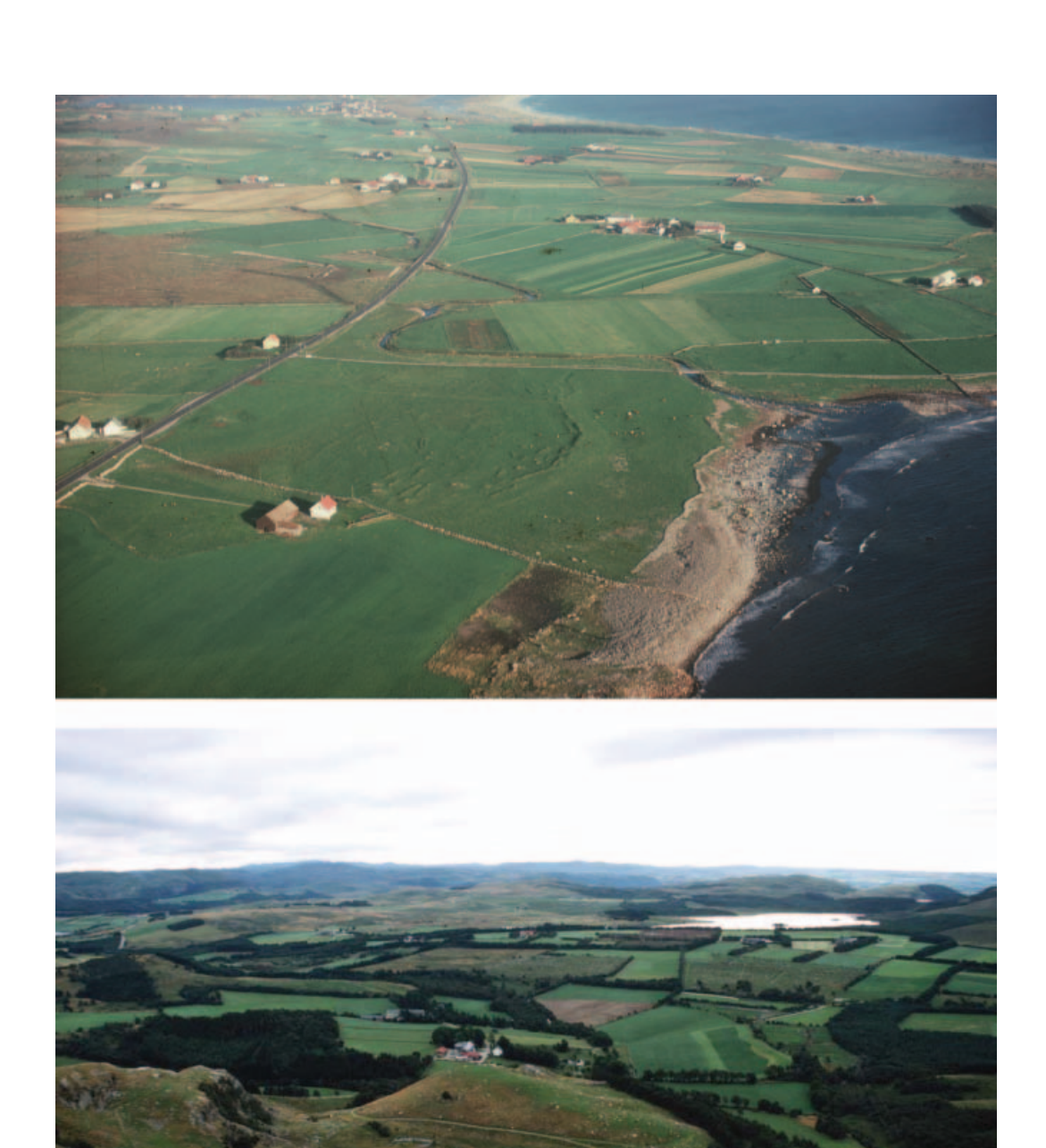
Fig. 2. The agrarian landscape in Jæren is uniform and mainly treeless farmland of low-lying, undulating lowland with a restricted area of upland. The natural environment is scarce with remnants of forests, wetland and unfertilized pastures.