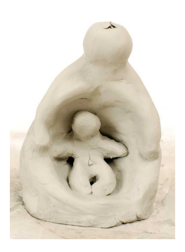
(M 3): I'm mostly the one inside, I guess... (...). Many who look at me are talking, and they think that I'm tough and all that, which I am not at all. But very few know that.

This metaphor reveals an image of a mother who needs to be taken care of. When the mother states that she is mostly the one inside, it becomes clear that she is probably both of them - that this is not an image of a mother and child, but of a mother who is both weak and strong.