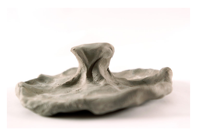
M 2: It (the figure) is like a growing tumour that developed in the stomach. It's a feeling I have all the time, and I have pain in my stomach. I actually don't know how to express it more accurately (...).

R: Is the tumour in the stomach a symbol of your ED?