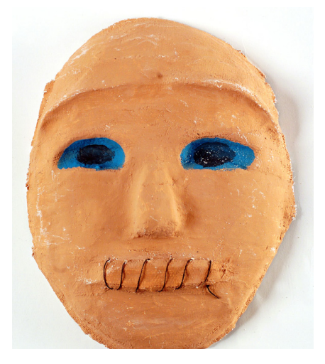
I feel as if I'm leading a double life. I think that if I suddenly became angry I would be afraid that so much would come out that I would become sort of crazy. There are so many things that want to come out. I'm afraid of losing all control.

The following metaphor describes a dialogue that illuminates the feeling of leading a double life. This mask represents control and describes incongruence in the way one actually feels and acts out the feelings. The enigma of this mask is understood as a dialogue about whether the feeling of living a double life increases or decreases the worry about what will happen if one loses control. Therefore silence has become a solution and feelings are kept secret. The secret is hidden behind a mask; this mask is literally unable to speak, as the lips are sewn together.