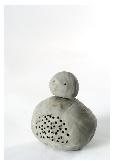
M2: Especially that one (the figure). It sort of grows and grows and grows... and those holes in the tummy symbolise how painful my stomach is all the time. How acid things are. (...). I think it represents my present state very well. In fact it includes a feeling of pain in the stomach. (...)

It's locked in the stomach. And it is the stomach that causes me trouble when I eat. It (the stomach) increases the hunger – and it is disgusting afterwards. It's there (in the stomach) all the bad feelings related to the ED reside.