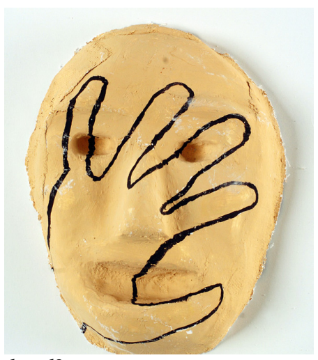
R: Why the hand?

M 1: Because it hides... (silence). It's often like that; I conceal everything all the time. It's also as if I am always in a good mood.