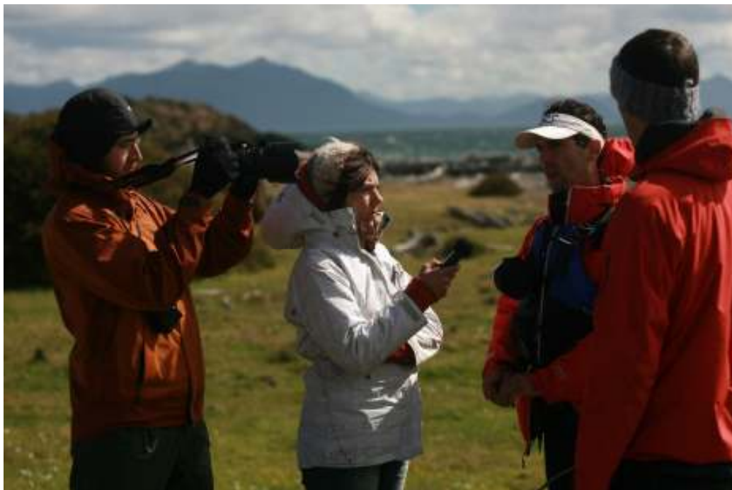
Figure 2. Racer being interviewed at CP 5.

The reason why the interviews at these stages of the race were short and not directly related to the research subject of this thesis is that, during the very limited amount of time that they spent at the checkpoints, they were concerned with changing gear and preparing for the following race discipline. Despite that, being able to travel to three different CPs and to ask the participants short questions greatly increased my understanding of the "behind the scenes" of the event and of the experiences of the races in the course of it. More detailed individual-racer interviews, which fall under the category of "audio material" in Table 1., were conducted and recorded by the race organizers at nearly every other checkpoint of the race.