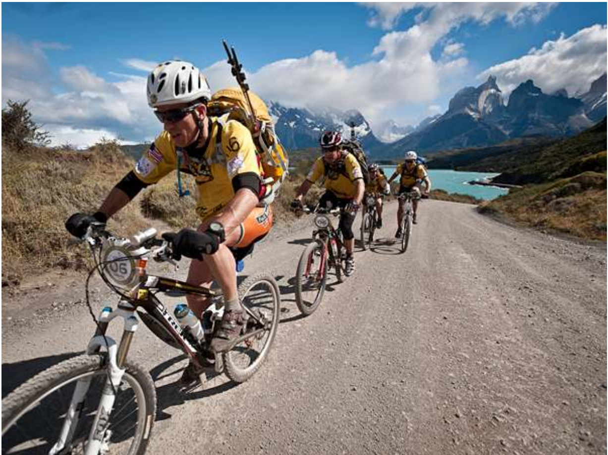
Figure 5. Team biking in Torres del Paine National Park.