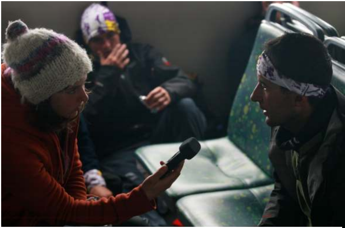
Figure 4. Racer being interviewed on the ferry from CP 20 to Punta Arenas.

On the ferry were found all the teams that completed the race course, which were 10 out of 19, and two teams that went close to completing it. Of the 12 teams that were on the ferry, only seven were interviewed because of time constraints. Among these seven teams, of which only one did not finish the race, 10 nationalities were represented, which cannot be disclosed due to confidential reasons. In fact, the teams, and consequently the team members, that were interviewed would be easily identifiable by visiting the official website of the PER. Of the seven teams interviewed only five were homogeneous in terms of nationalities. Team interviews were preferred over interviews with individual participants not only for time constraints reasons, but also to give the team members the chance to complement each other's points of view and to bring up new ideas through mutual interaction. The interviews were semi-structured, audio recorded and lasted between 24 minutes and one hour and 14 minutes, for a total time of over four hours. In addition to the audio recordings, personal observations were written down after each interview.