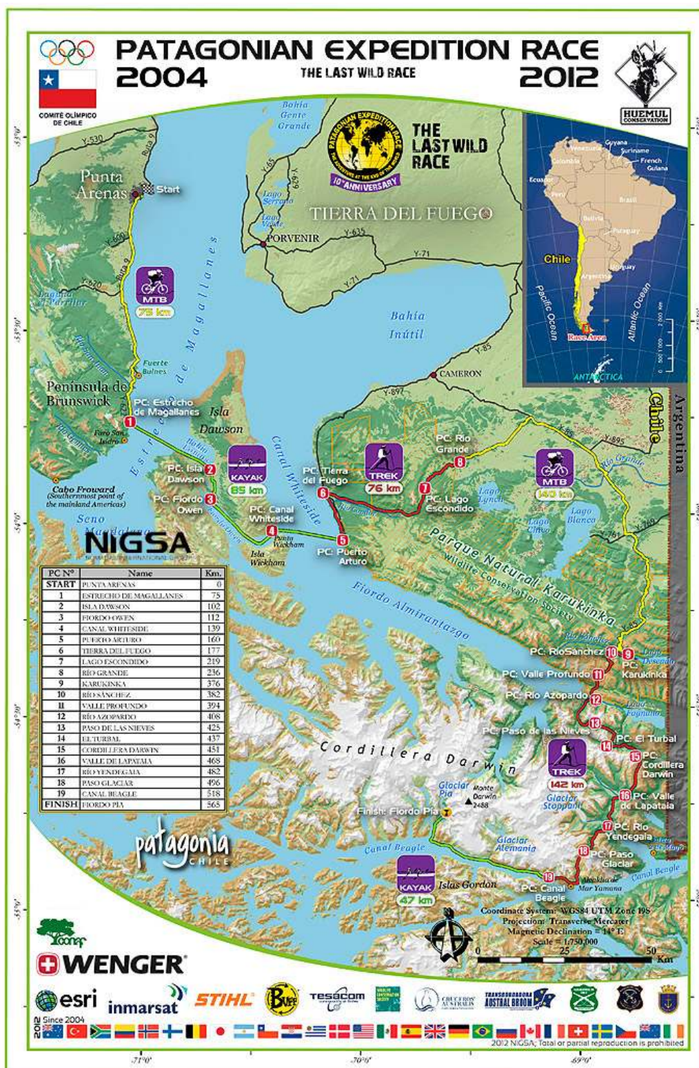
Figure 3. Course map of the Patagonian Expedition Race 2012.