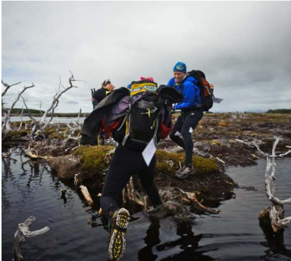
Figure 11. Racer being helped by a teammate to cross a pond.

A more explicit view on shared suffering is provided by another racer: "This is good, you know, to share everything as a team. My pain is their pain" (Cindy L. - Team Wind Guts - Data Source 6). Support was most of the times described as being mutual. Team synergy, which was manifested as working as a unit to achieve common goals, overcoming obstacles, facing unpredicted events and taking wise decisions along the way, was achieved through the combination of different factors.