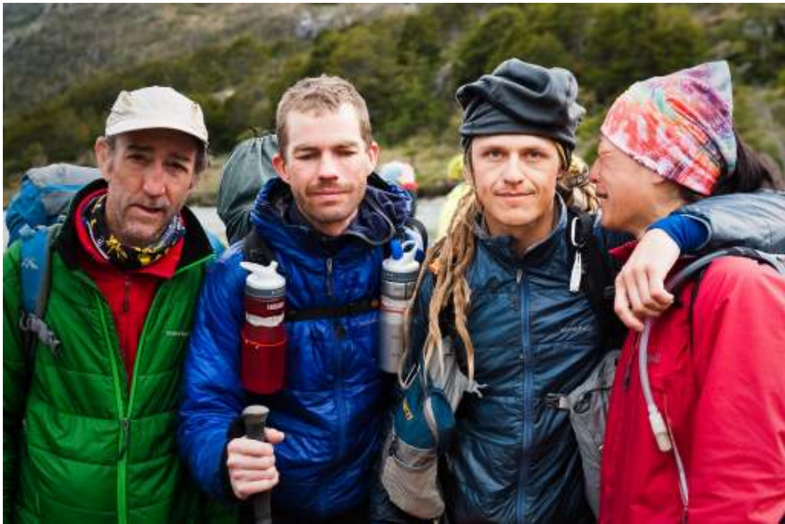
Figure 10. Teammates emotionally support each other when they realize that their race is over. By Hoare (2012b).

for successful teamwork. Besides trust in the teammates and confidence in one another's capabilities, respect, compassion, empathy, and emotional understanding were also identified among the elements at the basis of a solid teammates relationship.