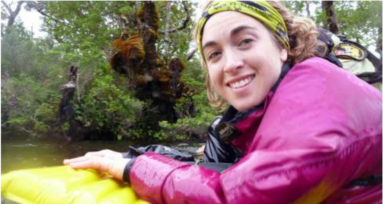
Figure 8. Racer floating down a river on a camping pad.

Moments of fun and play hardly lasted throughout the whole race. Data analysis showed that ups and downs came one after the other. When down moments occurred along the course, which was for instance in risky or challenging situations when strengths were low, the racers would think of their homes and families and had second thoughts regarding their participation in the race: