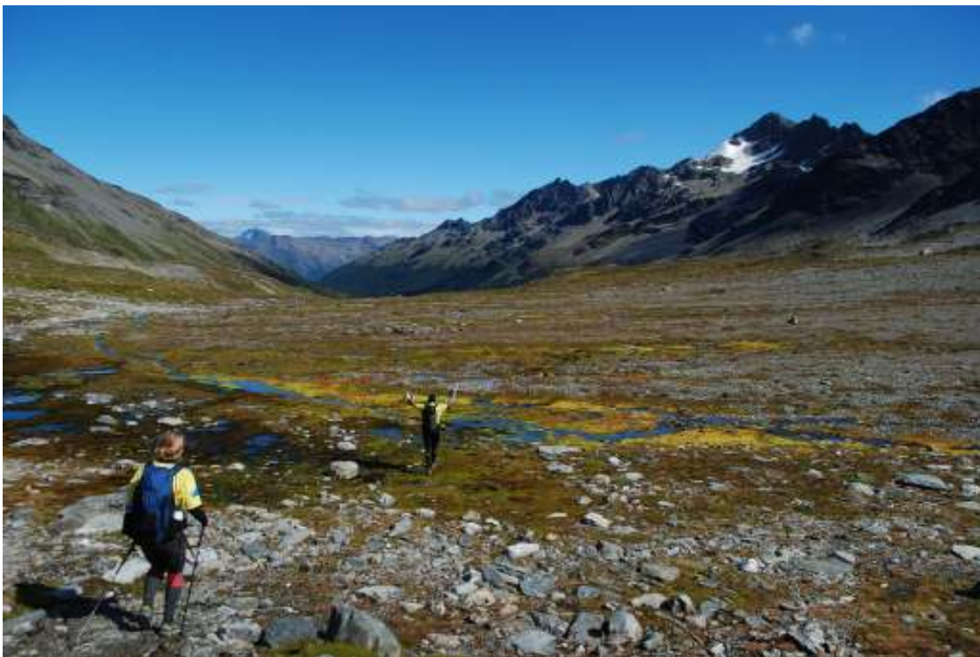
Figure 7. Racers and the vastness of Patagonia.

A couple of racers also argued that there has been a growing trend for people to go more and more out in the wilderness and to discover themselves. The primal lifestyle experienced by the racers was accompanied by a deep sense of humility, appreciation, and respect towards nature. By living on the premises of nature, the racers recognized the power of it and became aware of their weaknesses and the smallness of human kind in comparison with it.