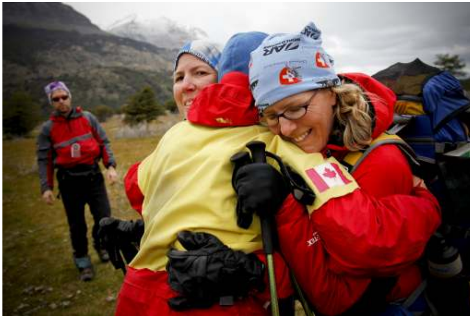
Figure 12. Racers from different teams hugging each other.

The eagerness of the racers to meet new people and to socialize was not exclusively addressed to the other participating teams, but also to the race organizers, who were met almost in the same occasions as the other participating teams.