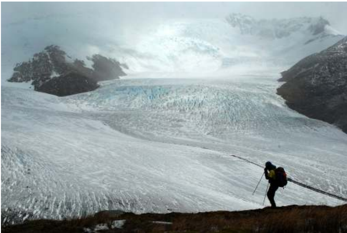
Figure 9. A participant reaches one of the remote glaciers along the race course.

The PER takes place in a completely isolated area, out of this modern world and participating in it will be in some ways like landing on the Moon: no civilization, no “hello pizza” signs, no mail or mobile phone to waste time with. It will be like going back to the roots of adventure or like joining the Mother of all Adventures. (Tina T. - Team Cachai - Data 5)