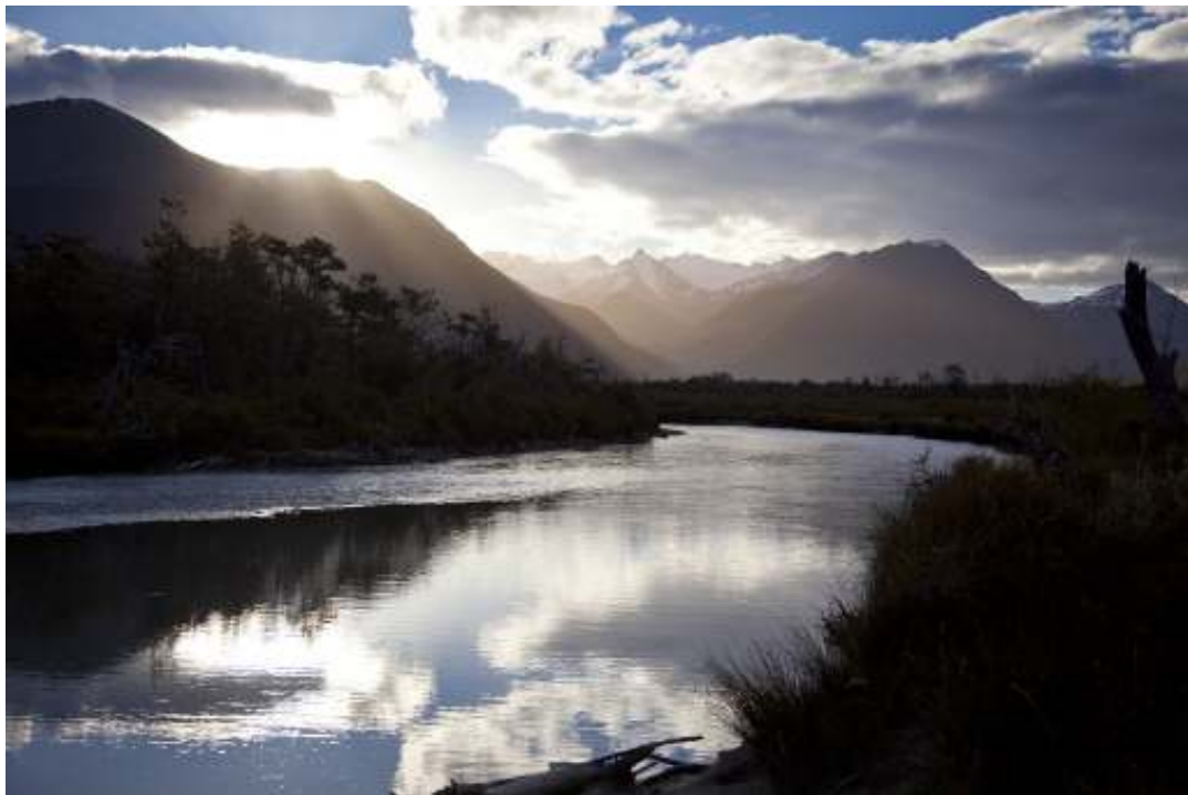
Figure 6. Landscape of the Land of Fire.

Another aspect identified was the contrasting feelings that the participants experienced towards the surrounding environment. The area traversed by the racers was described as a land of extremes: It was wild, breathtaking, fantasy-like, with overwhelming sceneries, but also harsh for the nature of the terrain and for the unpredictability of the weather conditions. The PER participants, especially during the longest treks, happened to see no humans for days and had the feeling to be, as one racer observed, "as far from civilization as it is humanly possible to get" (Lionel R. - Team Ear Wigs - Data Source 6). The race environment was described as "proper wilderness": No trails, no foot prints, no signs of civilization.