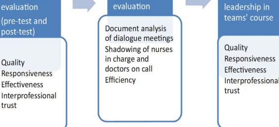
Figure 1 Components in the current study.