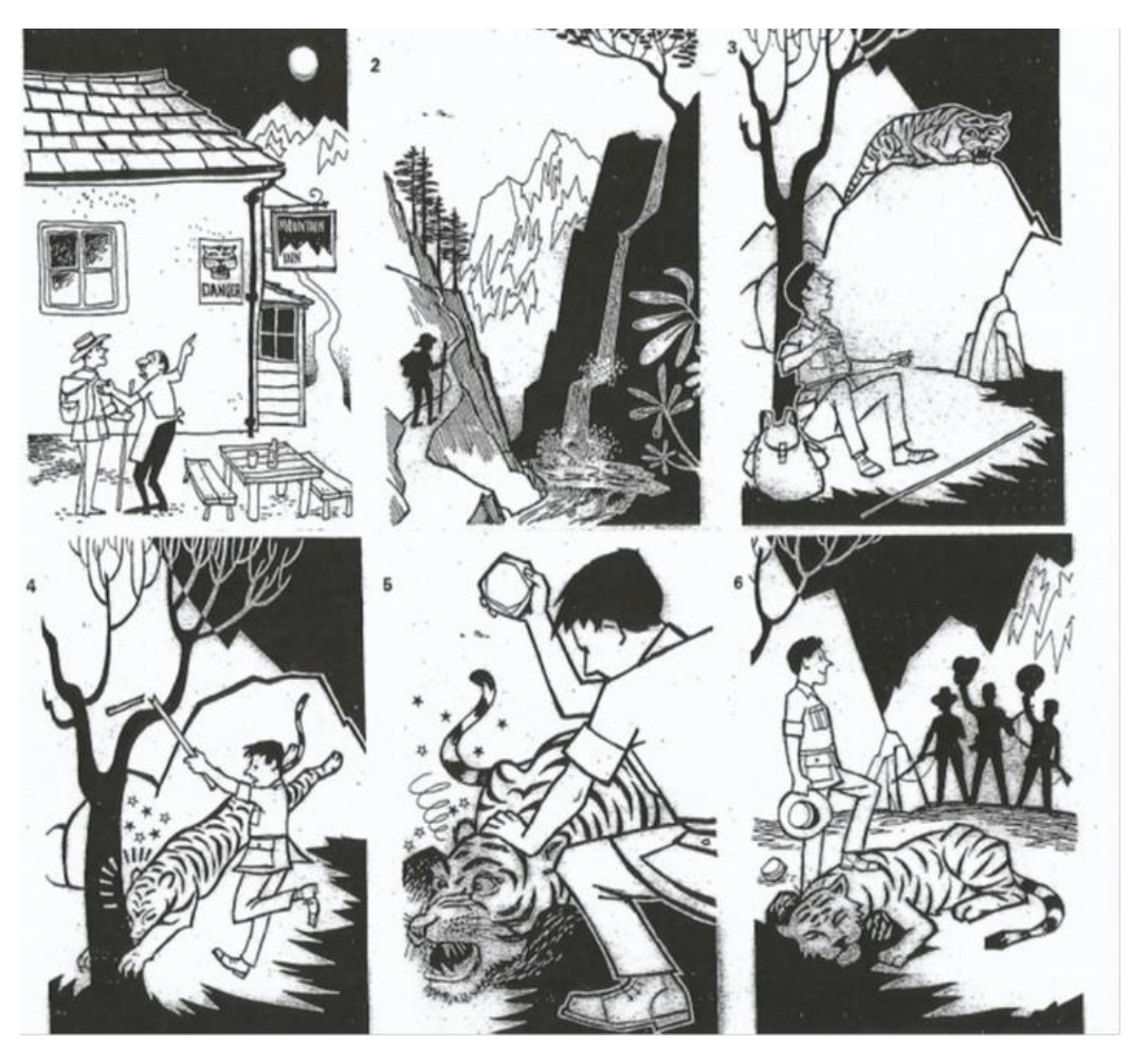
Figure 1: The picture story

The teachers' instructions read as follows: