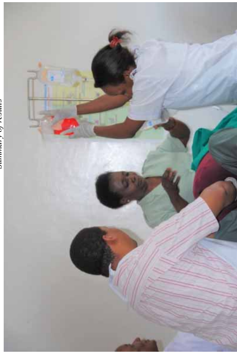
Picture 6 PPH-scenario at Mawenzi Hospital, with IV fluids and blood transfusion