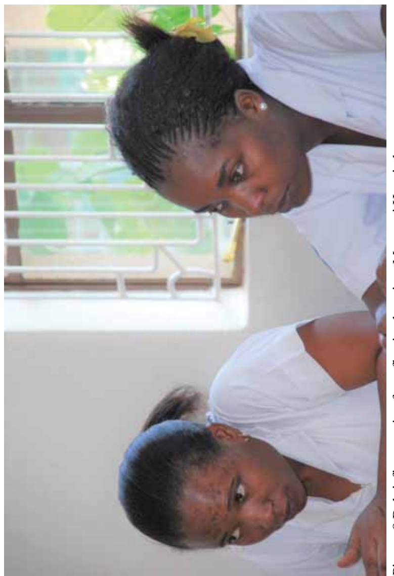
Picture 8 Debriefing session for reflective learning. Mawenzi Hospital