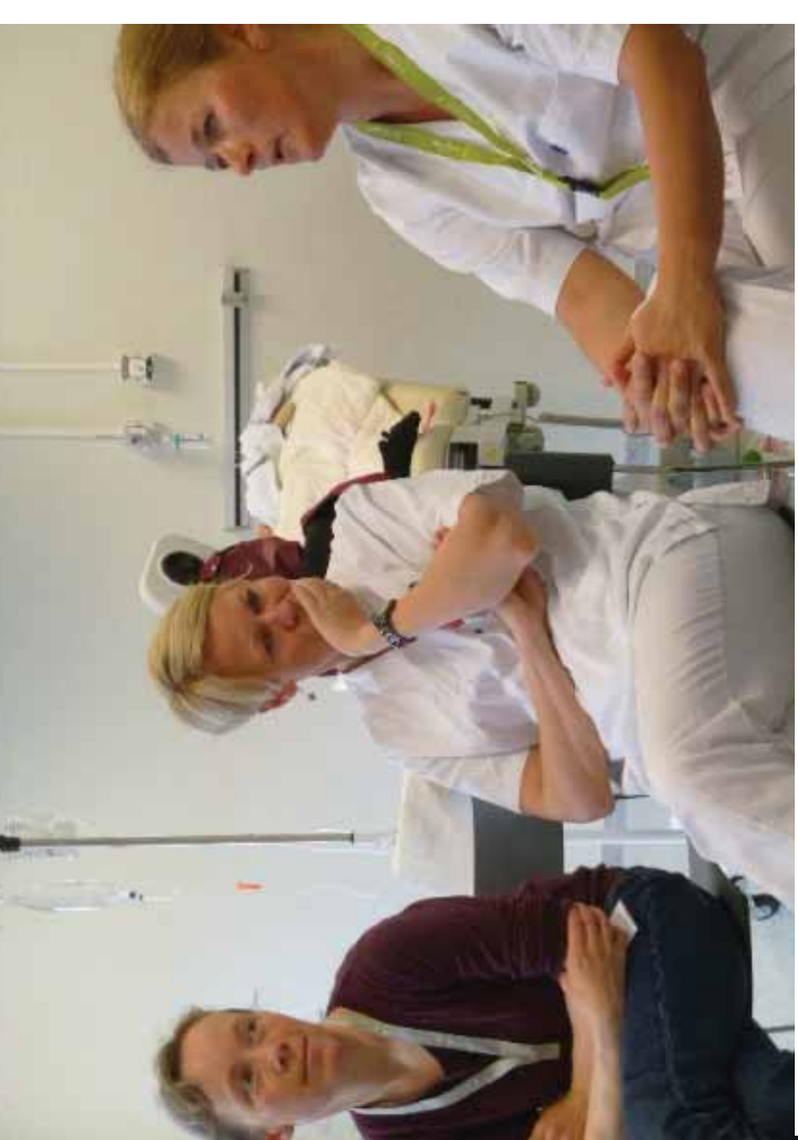
Picture 2 Discussion among faculty on the simulation training. UNN Tromsø