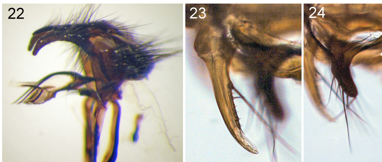
FIGURES 22–24. Pollenia bartaki sp. nov., holotype ♂ (CULSP). 22. Genital capsule, right lateral, slightly oblique view. 23. Postgonite. 24. Pregonite.