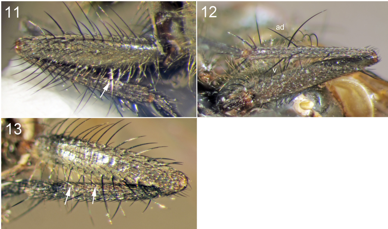
FIGURES 11–13. Pollenia bartaki sp. nov., holotype ♂ (CULSP). 11. Fore leg, posterior view. Arrow points to base of single posteroventral seta. 12. Mid leg, posterior view. 13. Hind leg, anterior view. Arrows point to bases of anteroventral setae. Abbreviations: ad—anterodorsal seta; v—ventral seta.