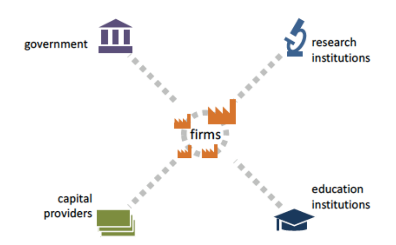
Figure 1. The Gap model – types of actors in a cluster. Retrieved from "The Cluster Initiative", by Lindquist et al., 2013. p. 37.

The seven gaps provide meeting places and activities where common issues can be discussed and acted, together. This can help the cluster actors to overcome problems by interacting.