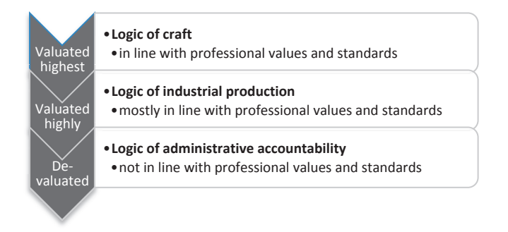
Figure 3 - Logics ranked on the value hierarchy

The interviews with the frontline workers gave an insight to a work-related value hierarchy. This hierarchy can be related to a ranking of the three logics according to how far they seemed to match the frontline workers' inclinations towards professional values of social work and their loyalty to NAV's organizational mandate and mission regarding providing welfare and work inclusion services to citizens. The frontline workers' valuation of work tasks in ways that matched their 'ultimate concerns' as professional social workers, can be seen in relation to the three institutional logics as depicted in the figure below.