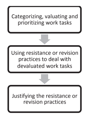
Figure 2 – Summary of tendencies among frontline employees during the FG implementation effort

As described in the previous chapter, statistical findings provided from central levels of NAV had shown that the use of the FG was high at the case office during the two years prior to the onset of the case study, but that its usage had plummeted only a few months prior to its onset. This could indicate that something had happened during the implementation efforts at the case office. The way that the frontline workers had responded to the implementation instructions of the FG and other similar instructions, therefore, became a central focus among the enquires in this thesis. Three interrelating tendencies among frontline employees that emerged during the analysis are depicted in figure 1 below and elaborated on in the following section.