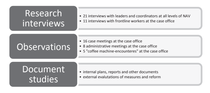
Figure 1 – Empirical sources and data material