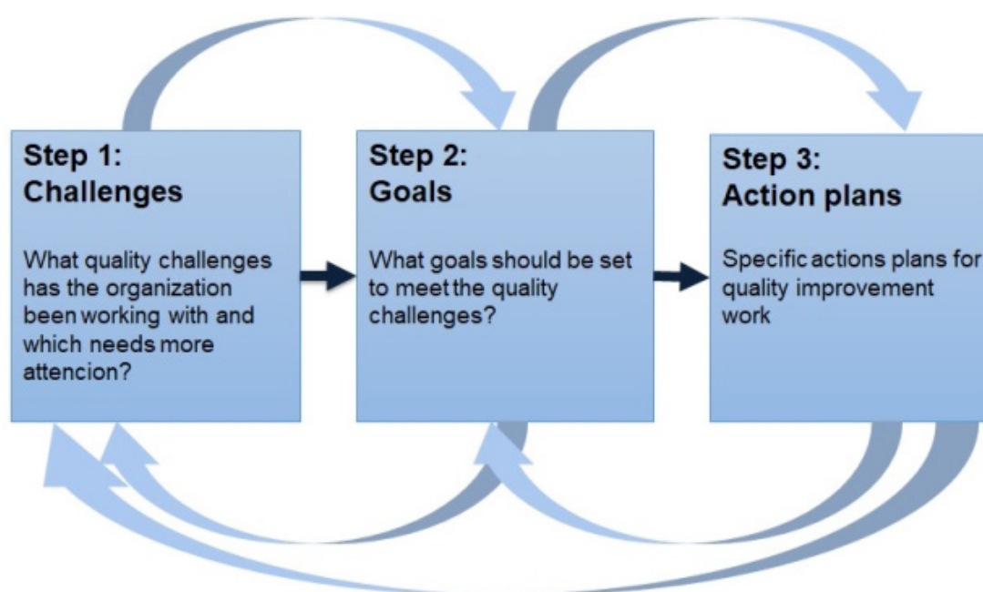
Figure 1 Three-step process.