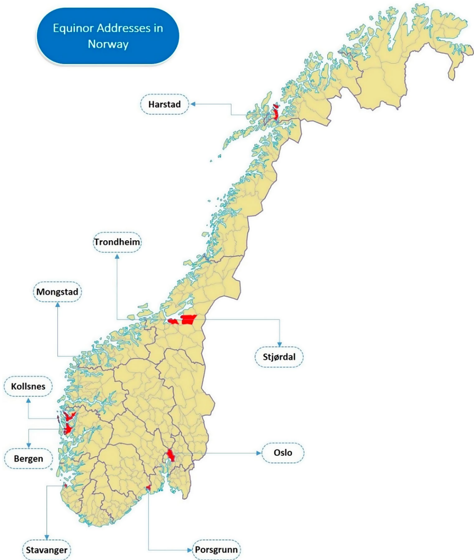
Figure 1. Equinor addresses in Norway.

Note: The map indicates the Equinor addresses found in the database and used in the analysis and not all Equinor bases in Norway.