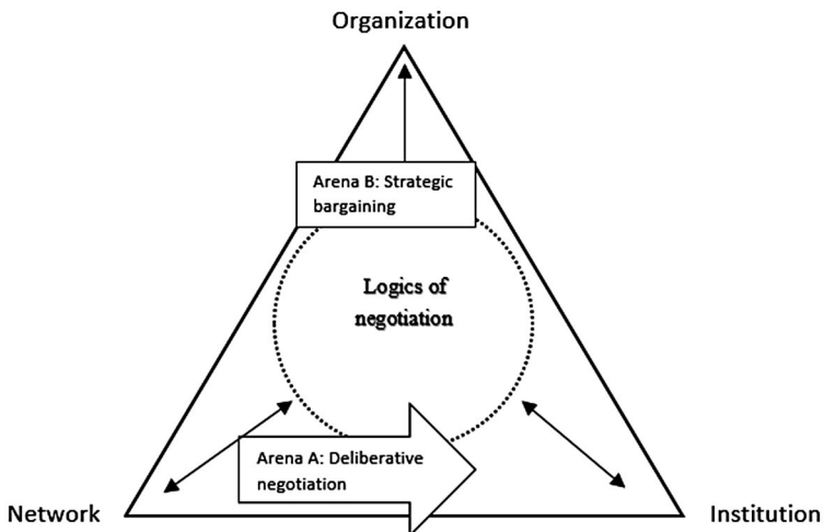
Figure 2. Findings According to Theoretical Approach.

The characteristic of Arena A illustrates a network of autonomous municipalities with the goal of finding a common solution for future merger. Both administrative and political members of the network saw the reform as an opportunity to develop a new sustainable municipality. They were also mutually depending on each other to create this new municipality (Sørensen & Torfing 2007).