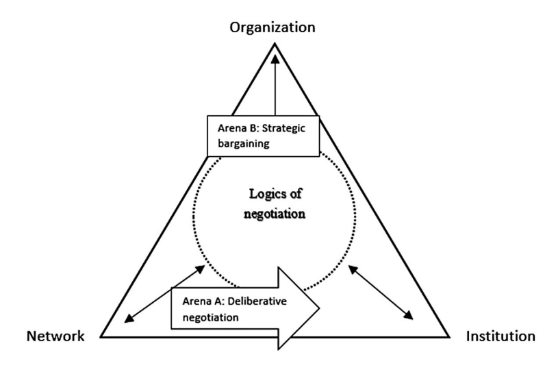
Figure 2. Findings According to Theoretical Approach.

The characteristic of Arena A illustrates a network of autonomous municipalities with the goal of finding a common solution for future merger. Both administrative and political members of the network saw the reform as an opportunity to develop a new sustainable municipality. They were also mutually depending on each other to create this new municipality (Sørensen & Torfing 2007).