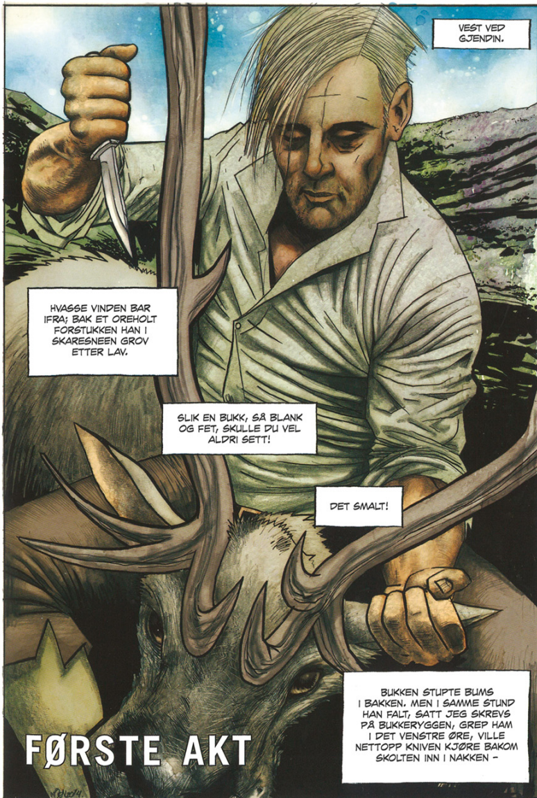
Figure 1: Ibsen/Moen/Mairowitz (2014), 5.