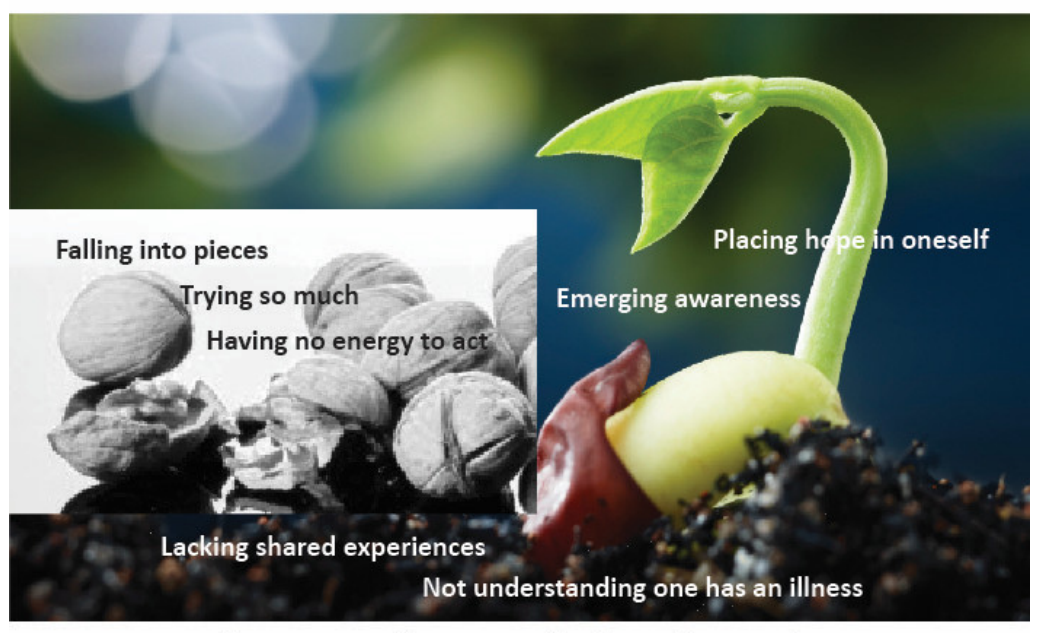
Inner experience: metaphor of a seed