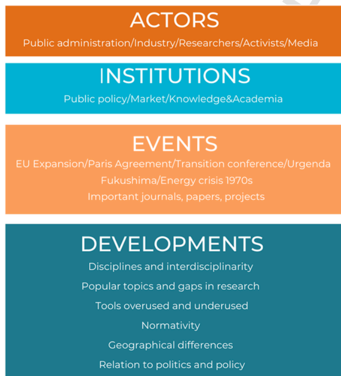
Fig. 2. Frontrunners' view of the field Source: Authors.

However, most SSH research is conducted on water, sun and wind (WSW) energy. Other technologies, such as bio-fuels, biomass, biogas, biogas and geothermal energy, are predominantly studied by 'hard' sciences (e.g. engineering). Another weakness of SSH research is that it is too often focused on one technology, one case or one configuration. These types of analyses are not able to capture the true complex-