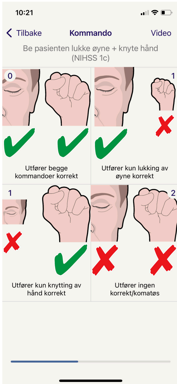
Figure 1 Level of consciousness command 1c as shown in application. NIHSS, National Institutes of Health Stroke Scale.