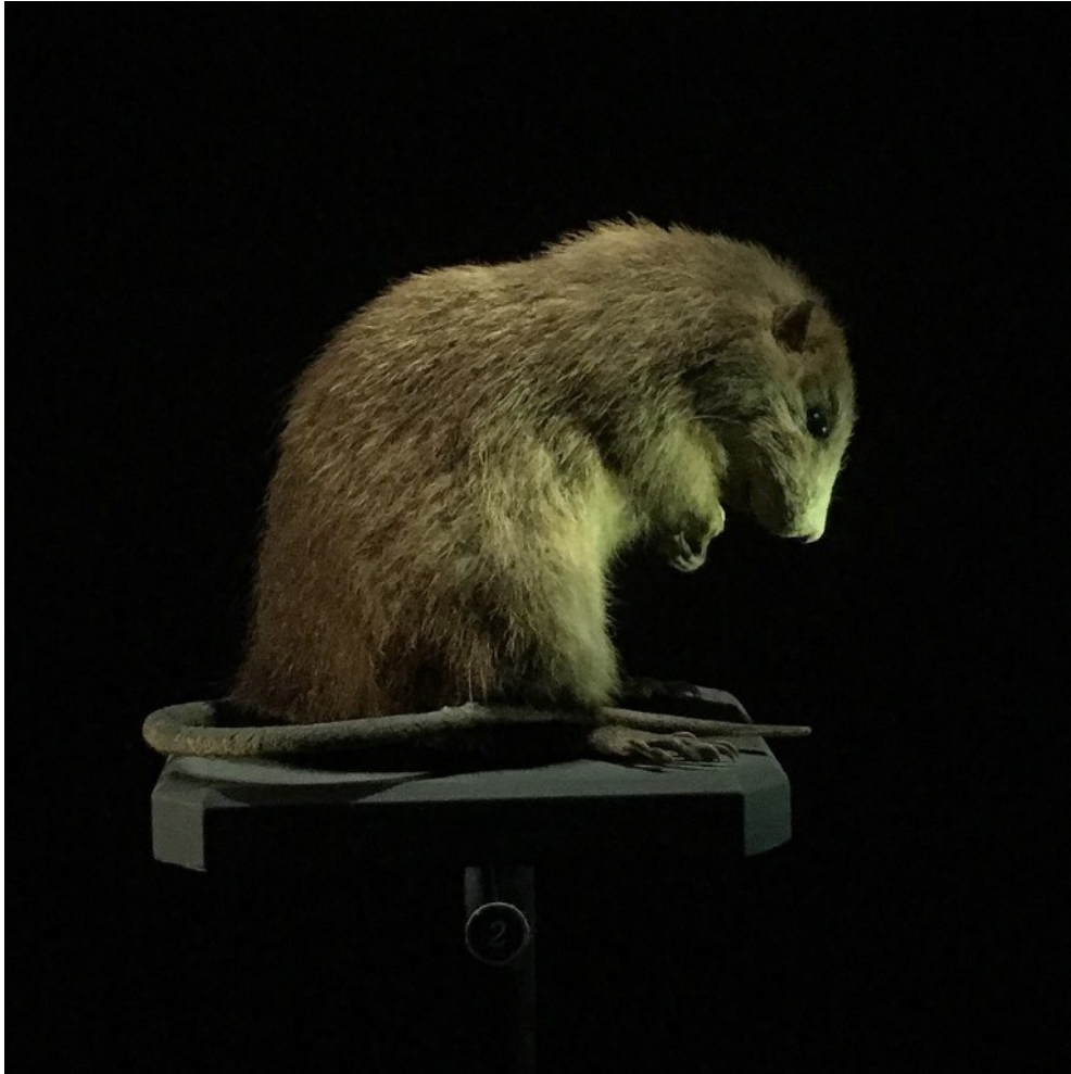
Figure 1. Taxidermy Saint Lucia giant rice rat ( Megalomys luciae) at the MNHN (MO-1994-1329).

giant rice rat reads “the Saint Lucia giant rice rat disappeared under circumstances that remained unclear. The species is known only by two specimens, one of which is presented here.” [translated from French].