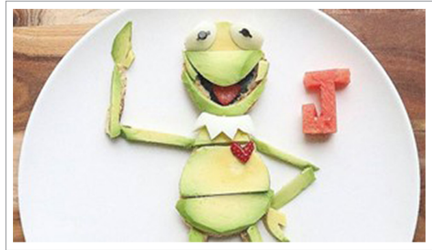
FIGURE 2 Laleh's Kermit

meals into foodart. The first creation were pancakes in the shape of a lion face, which, as Laleh revealed in an interview with The Craftsman (The Craftsman Agency, 2019) were an impromptu response to a request from her son.