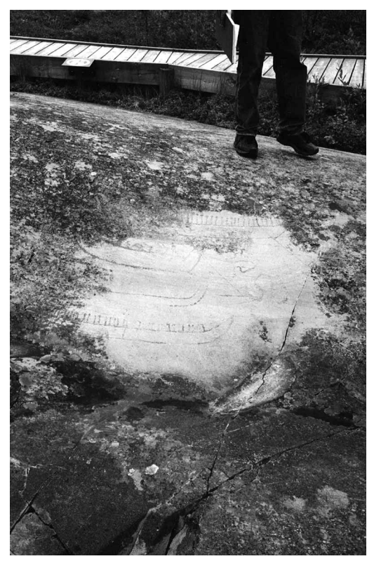
Fig. 5. When all vegetation, in this case lichens, are removed, it becomes more difficult to regard rock art as a part of the landscape. The naked rock only visible where the lichens are removed is here so light that if just the lichen in the grooves had been removed, the rock carvings would be easily seen, even without painting. Photo from Alta, Finnmark, N. Norway (2003) S. Bakkevig.

From time to time tourists have scratched on unpainted Norwegian rock carvings in order to make them more visible. At the site Bru on the island of Rennesøy, Western Norway, low visibility of rock carvings has led to catastrophic results. Beautiful carvings of two ships were re-chiselled in the intention of making them more visible (Bakkevig 2002b:50). By making them more visible by painting or by emphasizing the contrast between a light lichen free furrow and the greyer surroundings, this destruction of the original prehistoric rock art could probably have been avoided.