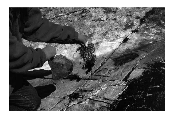
Fig. 3. Unsuccessful experiment with gluing loose exfoliation crusts at Vingen, Bremanger, W. Norway, by use of a glue containing Mowilith. The crust has loosened and a whitishglossy layer of hardened glue is visible in lower part of the picture. The cracking effects of thin herbaceous roots are also visible.

The joint between two objects glued together should be as narrow as possible to give maximal strength. However, there is a difference between one-compound glue, which shrinks when drying, and two-compound glue, which hardens through a chemical reaction without shrinking. Unfortunately the glue used on rock art shrinks, and thus, especially when used diluted, leaves cavities when drying in microscopic pores. These cavities are later accessible for water penetration and frost wedging.