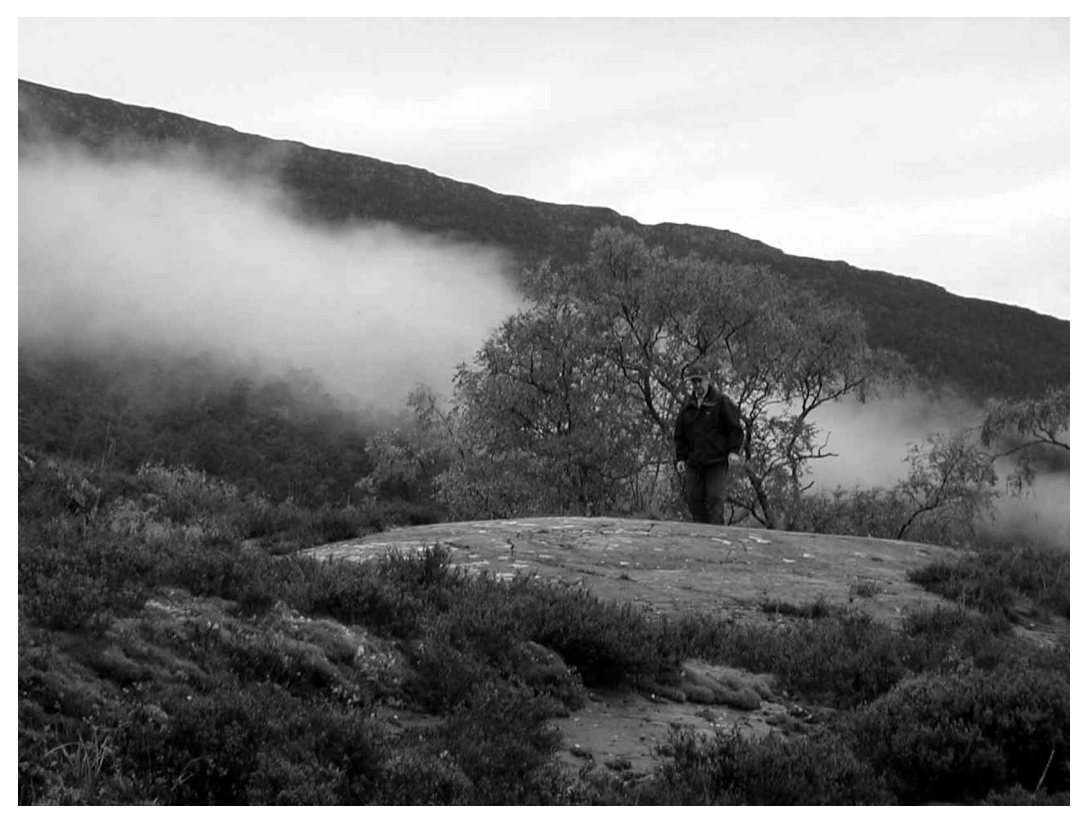
Fig. 1. The rock art itself has no or quite minimal ecological influence on the environment, but should be interpreted and experienced within the natural frames given by the landscape. The author is here standing behind a rock art panel at Ausevik, Florø, Sogn og Fjordane, W. Norway.

environmental factors of a site into the interpretation. If for example the rock art site itself had a shamanistic value, surely this was also the case for the nearby environment. 'Without knowledge of the landscape, and without situating the rock art in relation to the features of the rock and the landscape, we cannot fully understand and interpret informed sources such as ethnography and histories. Rock art is fundamentally based in the land'.