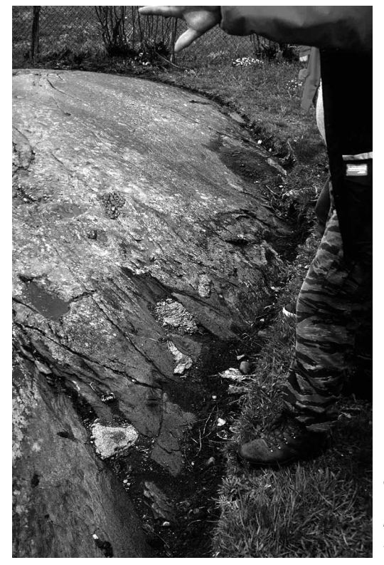
Fig. 4. Unsuccessful use of mortar on the rock art site Bakke I, Jondal, Hordaland, W. Norway. The mortar has begun shrinking and cracking in less than 20 years.