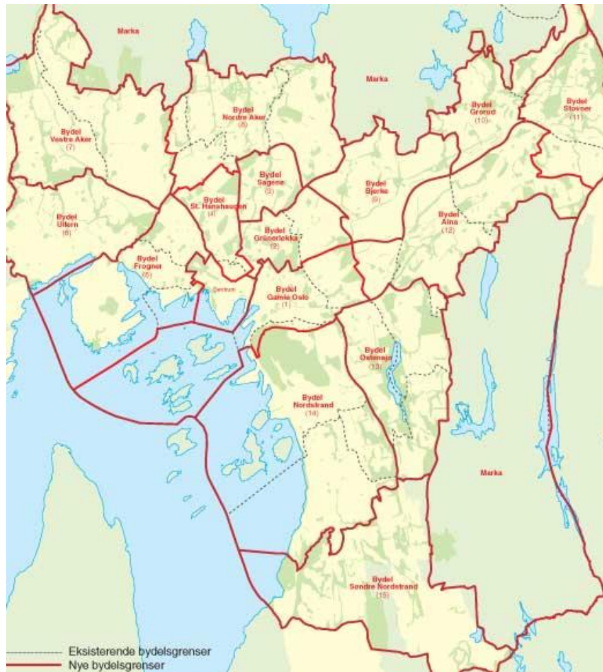
Figure 2.2.1: Districts in Oslo; Southern Nordstrand located at the end of the picture

By the late 70th century and foremost to the present day Southern Nordstrand experienced rapid development. The district consists of 36,000 people who are spread over four sub-districts Mortensrud, Bjørndal, Hauketo / Prinsdal and Holmlia (Aktivitetsrapport, 2011). This district consists also of the city's youngest population; in addition, 50% of the residents have minority backgrounds. At least 30 % of the residents are under 20 years old and less than 2 % is over 80 years old (Ruud & Vestby, 2011). The development of rapid expansion and residential structure impacts the age composition and Southern Nordstrand is a district suited for families and large households because of housing offers. The multicultural population provides both enrichment and challenges for the district. High tolerance for differences and a society where no one stands out are some of the positive factors (Ruud & Vestby, 2011).