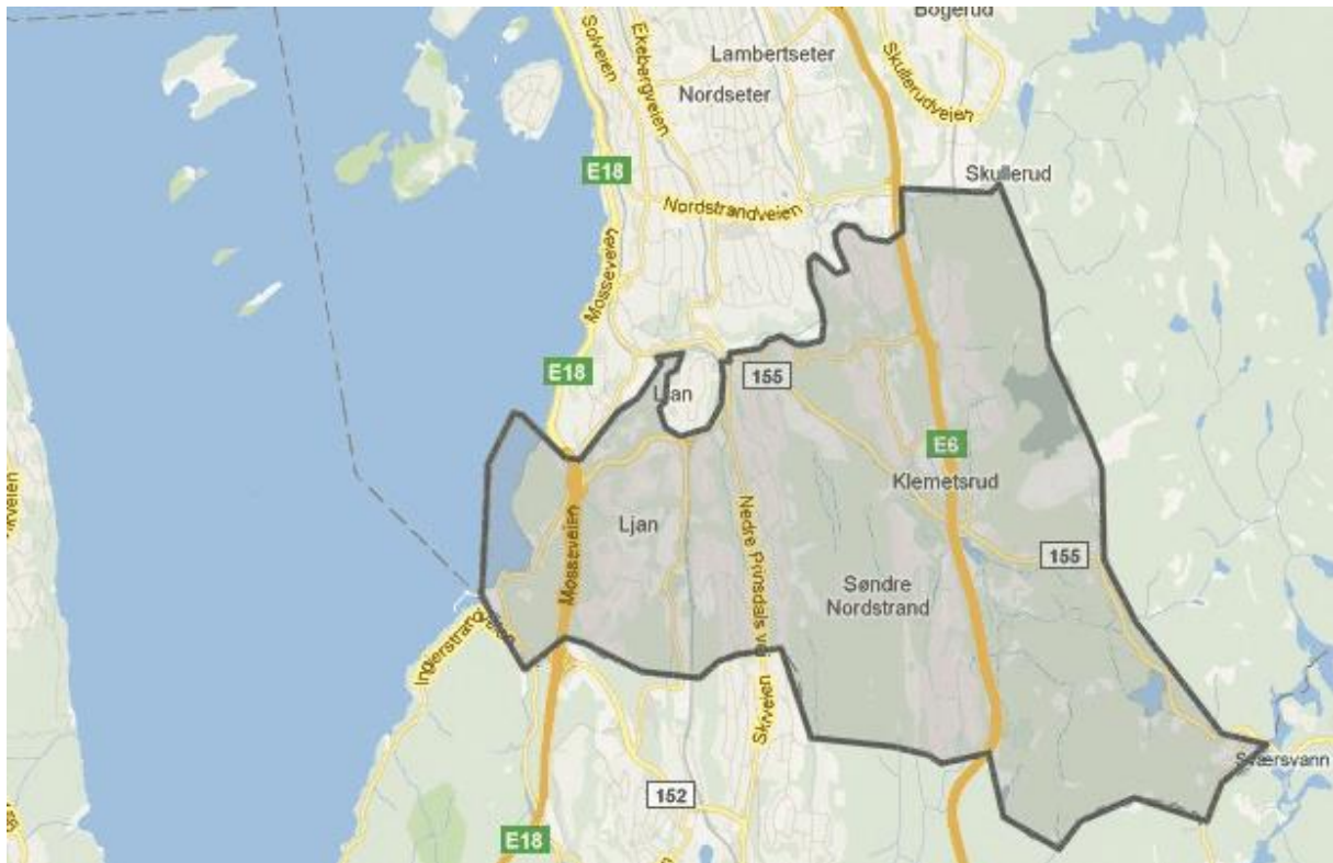
Figure 2.2.2: Southern Nordstrand

The challenges the districts have are many, the education and income level of the population is lower than the average of Oslo, and the district has a higher incidence of difficult living conditions than the city average (Ruud & Vestby, 2011). The percentage that drops out of high school is high, beside of this; the child protection measures have a higher proportion than average of Oslo (Ruud & Vestby, 2011).