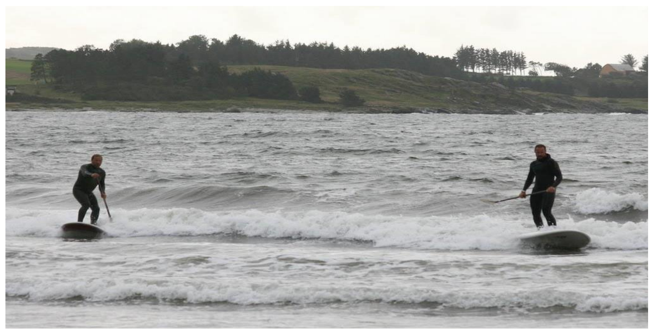
Figure 8. Interviewee P-2 with Crown Prince of Norway.

The informant describes how being one of the old well known surfers in the region gave him the chance to surf with the Prince of Norway and how this made him feel very proud of himself and of being a surfer.