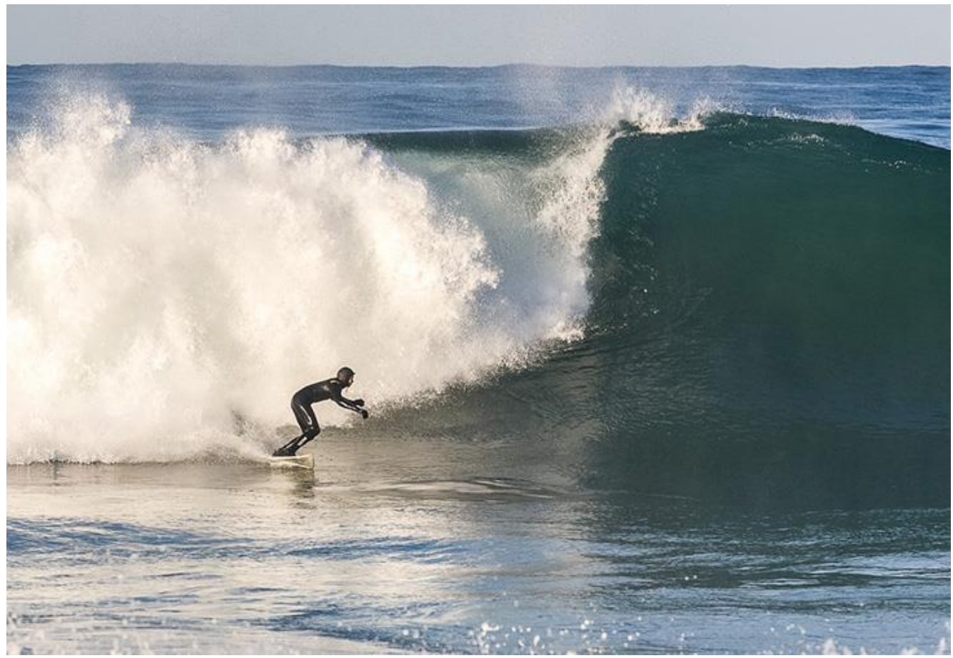
Figure 6. A Surfer in Jæren, Norway.

Similarly, another surfer expresses how he sometimes loses self-awareness and forgets what he has just done while riding on top of a wave: