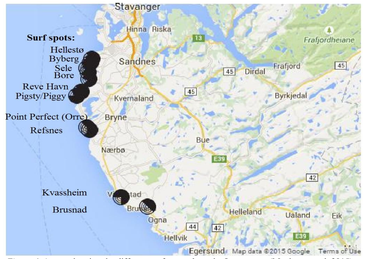
Figure 4. A map showing the different surf spots along the Jæren coast (Magicseaweed, 2015).