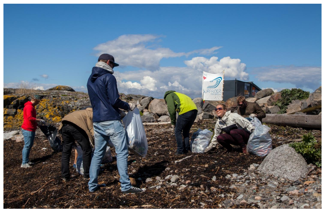
Figure 7. Surfrider foundation, Norway - Beach clean up.

On the other hand, many people are under the impression that all-year surfers are out there in the ocean in the middle of winter, surfing big waves in cold water, storms and bad weather conditions, are attempting to prove something to themselves and to the world. Maybe they are trying to prove that they want, they can and will conquer nature. In opposition to this widespread idea, nature was not seen through surfers' eyes as a place where they attempt to conquer its different elements. They clearly expressed that they do not seek to fight nature or try to defeat it: