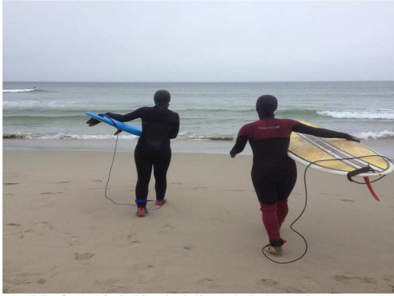
Figure 5. Two female surfers in Hellestø beach.

These female surfers admit that they face some difficulties as being a minority in the Jæren surfing subculture. Female surfers stated that they are initially not taken seriously by the male surfers. They are prejudged as incompetent surfers and are often dropped in on by male surfers; male surfers often steal the waves from them because they assume that they do not have the skills to catch the wave anyway: