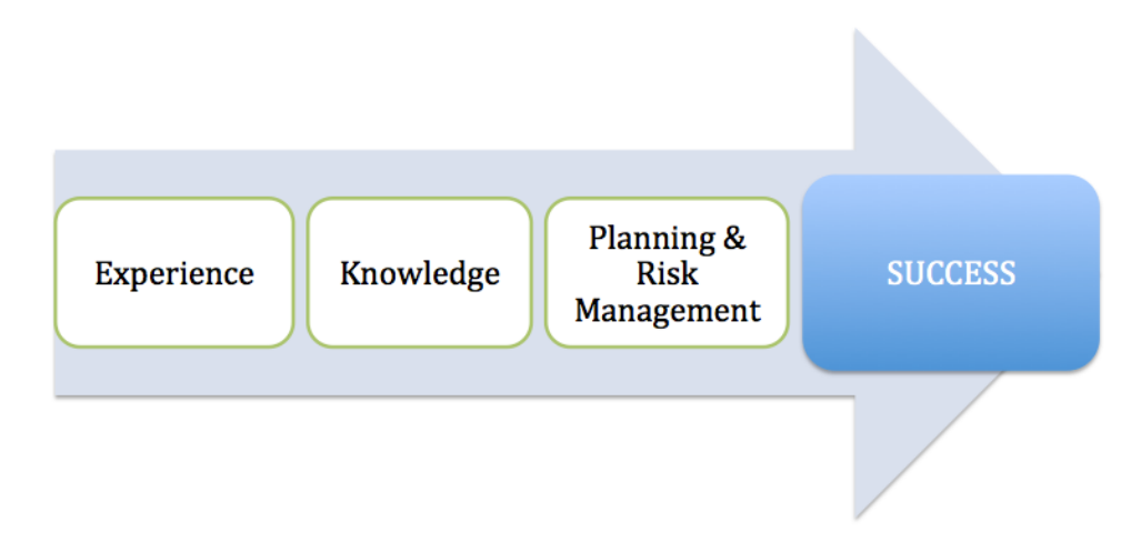
Figure 3. Proposed model for further research

Stemming from the findings in this study a model of festival success is proposed.