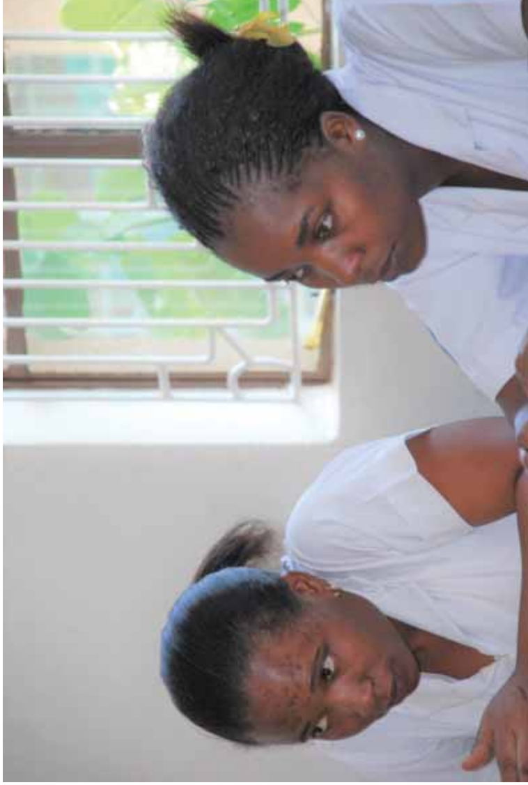
Picture 8 Debriefing session for reflective learning. Mawenzi Hospital