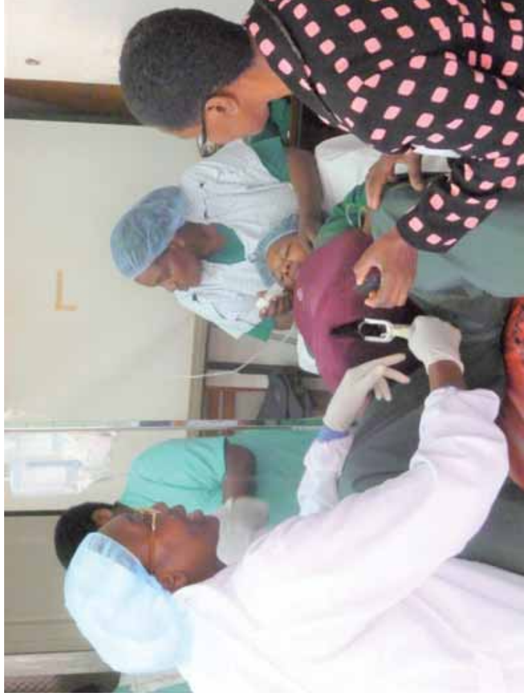
Picture 3 PPH-scenario in a multi-professional team. KCMC