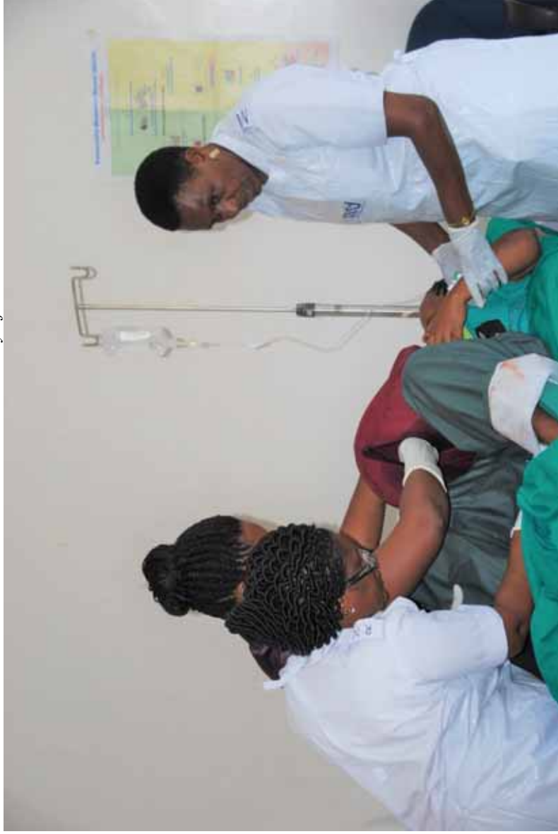
Picture 7 Another PPH-scenario. Mawenzi Hospital