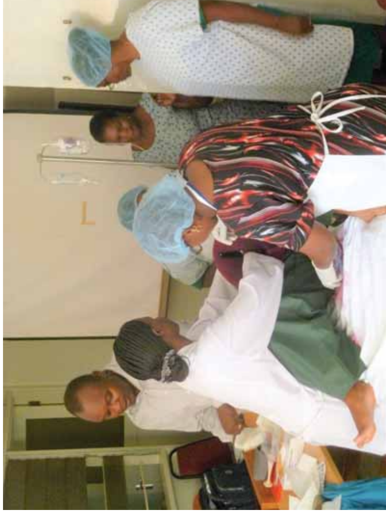
Picture 5 A PPH-scenario in another multi-professional team. KCMC