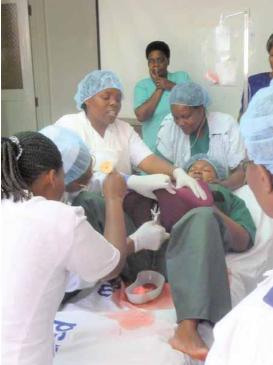
Picture 4 Repeat of same scenario with the same participants. KCMC