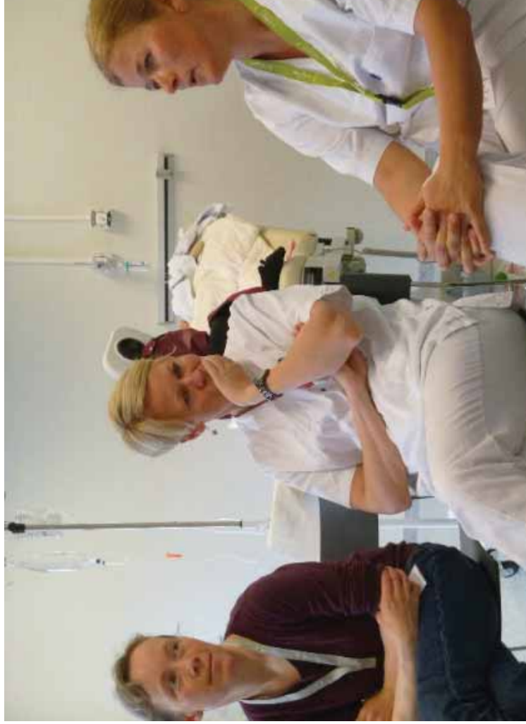
Picture 2 Discussion among faculty on the simulation training. UNN Tromsø