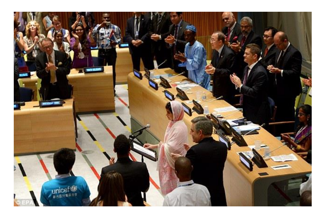
Figure 1. Malala Yousafzai addressing the UN. 2013

Courage: Malala was given a standing ovation and there were cheers of delight as she stepped up to speak