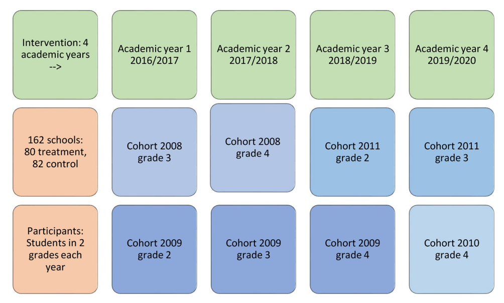
Fig. 2. Study design of the 1 + 1 project.

International Journal of Educational Research xxx (xxxx) xxx-xxx