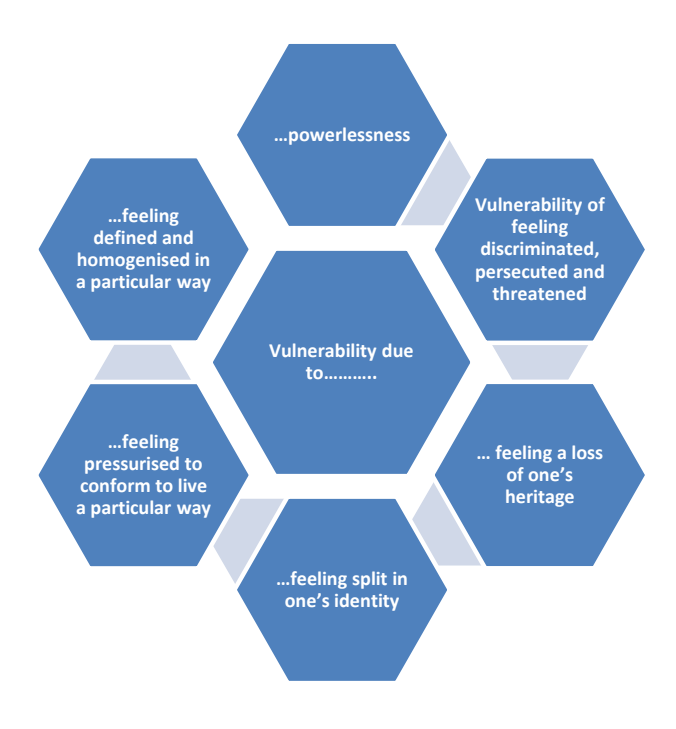
Figure 2 Constituents of Vulnerability experienced by Gypsies and Travellers