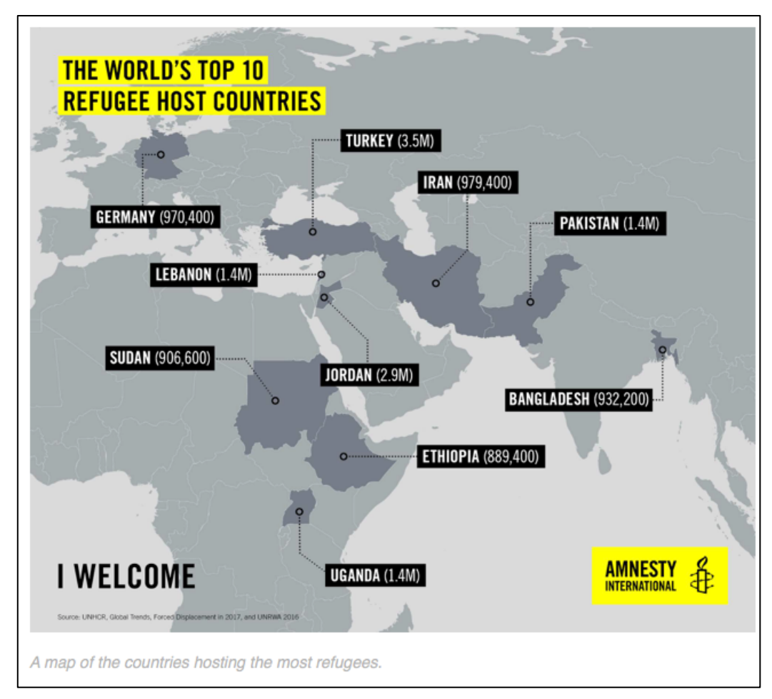
Figure 3: Map of the world's top 10 refugee host countries

Migration trends show that youngsters move further afield from their home countries in search of better life and opportunities as they have more physical capacities to endure intensive journeys (UNHCR, 2018, p. 18). Refugees from the Horn of Africa take the Northern Mediterranean route to move towards high-income countries in Europe. Figure 3 highlights ten major destination countries in the world for refugees where Germany is the only high-income host country; therefore, it was chosen as the other host destination country in the Global North for conducting research (UNHCR, 2018, pp. 17, 18 & 21).