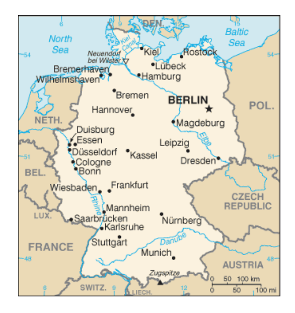
Figure 4 Figure 5