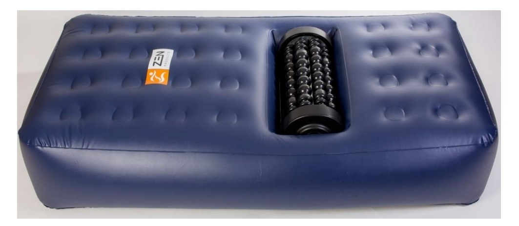
Figure 3. The Z-mattress placed over the Z-Roller.