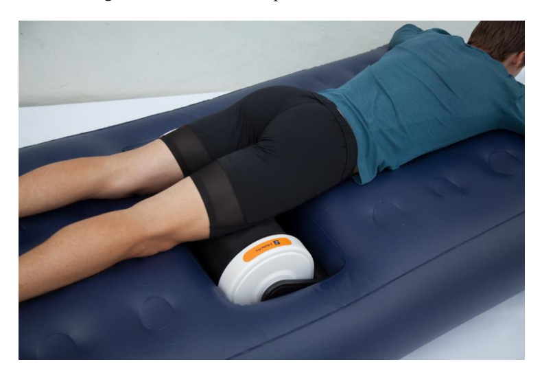
Figure 4. Participant laid face down on the mattress with the quadriceps muscle group placed on the Z-Roller.