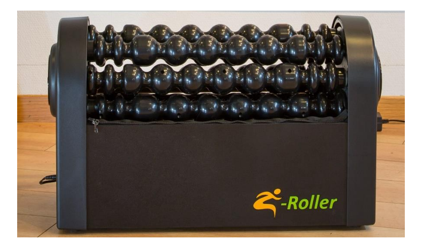
Figure 2. Z-Roller mechanical self-induced multi-bar roller-massager.