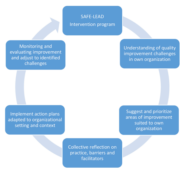
Figure 3 Logic model of the SAFE-LEAD intervention programme translating knowledge into practice based on knowledge to action framework of Straus et al. <sup>2</sup> SAFE-LEAD, Improving Quality and Safety in Primary Care – Implementing a Leadership Intervention in Nursing Homes and Home care.

data sources (ie, focus group interviews, observations, workshops). The data material is collected from many researchers and coresearchers who contributed to the development of the intervention. Observational data are, therefore, based on subjective interpretation from many researchers.