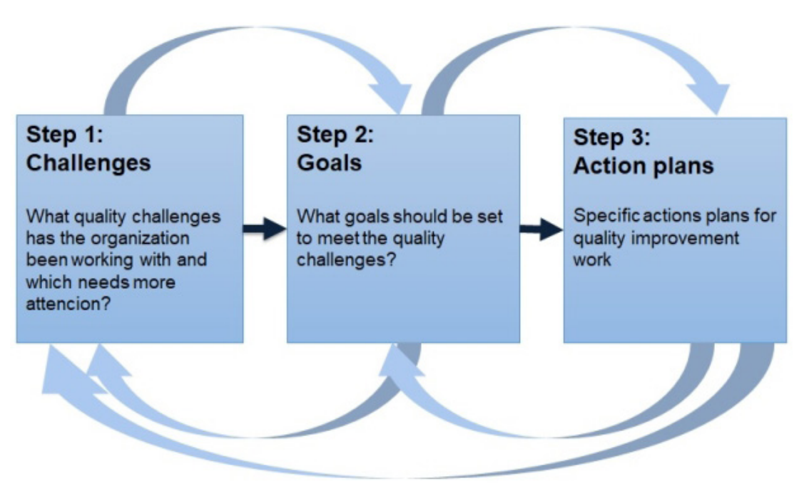
Figure 1 Three-step process.