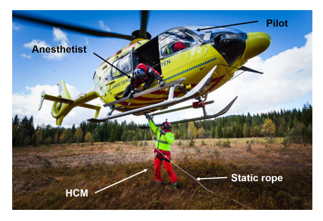
Figure 1. HEMS (state funded) static rope rescue. Setup with EC 135 P2+ (photograph from training, courtesy of Norwegian Air Ambulance).

The HEMS operational database NOLAS (a proprietary database management system; FileMaker Inc, Santa