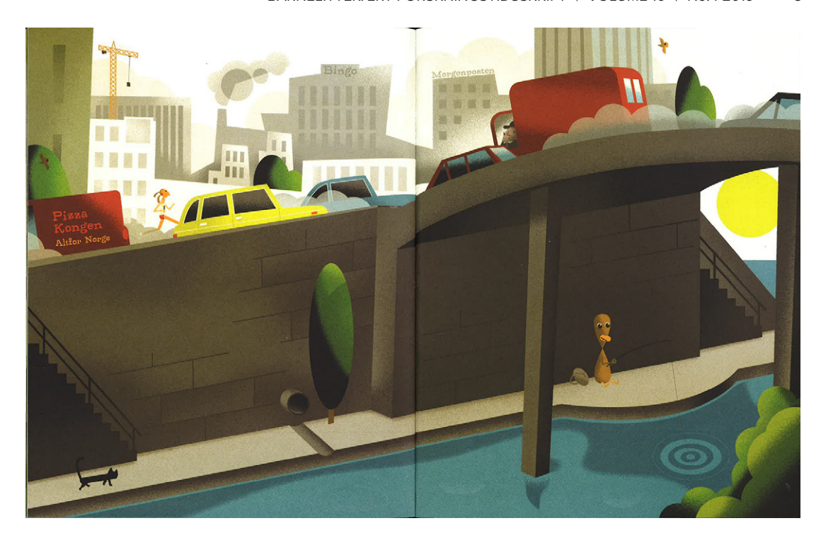
Fig. 2. Ragnar Aalbu, Anda i ødemarka (2012). Reprinted with permission from Ragnar Aalbu.

such as the Austin Maxi, make nostalgia a characteristic of the iconotext in general.