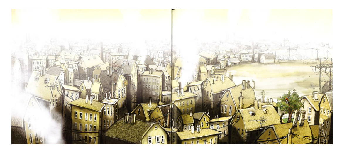
Fig. 3. Lisa Aisato, Fugl (2013). Reprinted with permission from Lisa Aisato.