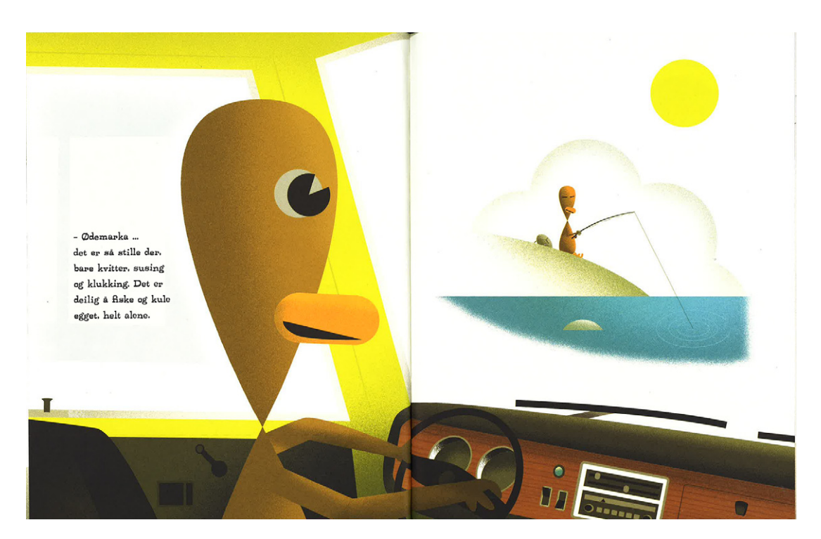
Fig. 1. Ragnar Aalbu, Anda i ødemarka (2012). Reprinted with permission from Ragnar Aalbu.

The story of the Duck's car journey, told entirely through pictures and dialogue, can be viewed as an example of a pastoral narrative, characterised by many of the typical features of this kind of writing listed by Gifford (2012). "The essential pastoral momentum" of retreat and return (Gifford, 2014, p. 18) is prominent, and so is an idealisation of the country, described in the sixth spread as truly idyllic: "it is so quiet there, only chirping, whooshing and gurgling" (Aalbu, 2012). The Duck's look of contentment as she envisions fishing on her own emphasises the sentiment in the verbal text. Further, the country not only becomes idealised but also gets associated with a feeling of nostalgia, expressed in the twelfth spread by a quote from "Going to the Country", a Bruce Cockburn folk song from 1970. Interestingly, visual references to other famous musicians of the 1970s, namely Elvis Presley and Johnny Cash, can also be found in the city, which, together with other period-specific features,