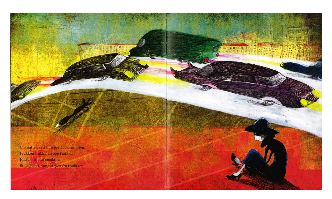
Fig. 5. Bjørn Arild Ersland & Lilian Brøgger, Glassklokken (2010). Reprinted with permission from Bjørn Arild Ersland & Lilian Brøgger.

The mysterious lady turns out to be a taxidermist who picks up animals killed by cars at night and brings them to life by stuffing and placing them in the glass dome, "a constructed biotope", as Anne Schäffer (2012) calls it, reminiscent of a morbid museum full of lush vegetation. One day, the lady finds a dead girl in a pool of blood. The child has already been introduced in the first spread, where she can be seen on a bridge with a man who is presumably her father. Later, the girl is moved to "her paradise", as the dome is called in the penultimate spread, and placed among rabbits that have been waiting in vain for a good playmate. Meanwhile the man goes looking for the girl at night. Eventually, the old taxidermist chooses to lead him to the dome by knotting pieces of the girl's yellow dress on trees. The last, wordless scene, where the man is standing with his back turned to the reader, looking at the girl among the rabbits, is the only one showing the dome in all its glory, filled with swirling, floral patterns of bright green and a few smiling animals.