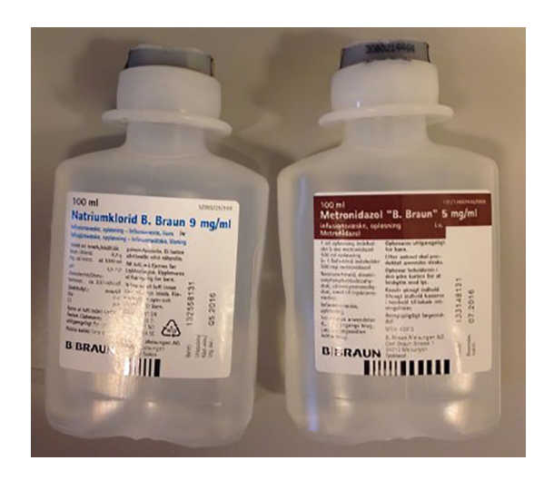
Figure 2. Drug confusion (look-alikes) between saline and metronidazole provided by the same pharmaceutical company.