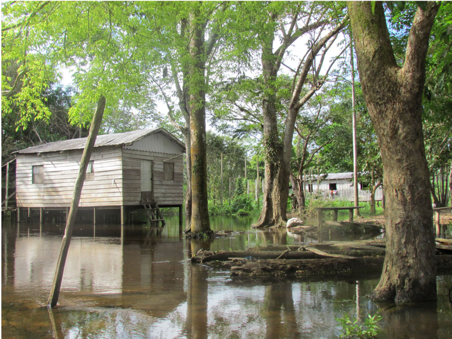
Fig. 1 A house in the Mamirauá Sustainable Development Reserve. The photo was taken early July 2018, towards the end of the high-water season.

barriers – i.e., it would be physically possible for the squirrel monkeys to cross the river, but they nevertheless stay within these borders. From an ecosemiotic point of view, it is tempting to interpret the black-headed squirrel monkey's behavior in this respect as involving a sort of conventional, group-based choices, operating with a cognitive map that is not inborn but rather collectively constructed.