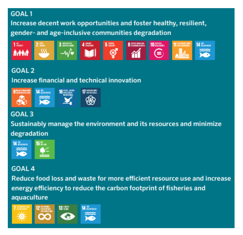
Figure 2: Blue Growth Initiative and the SDGs

The FAO explain that they intend to use the BGI to "further harness the potential of oceans, seas and coasts" and "assist countries in developing and implementing blue economy and growth agendas" (FAO, 2014a). The FAO envisage that the BGI will help to improve the following: