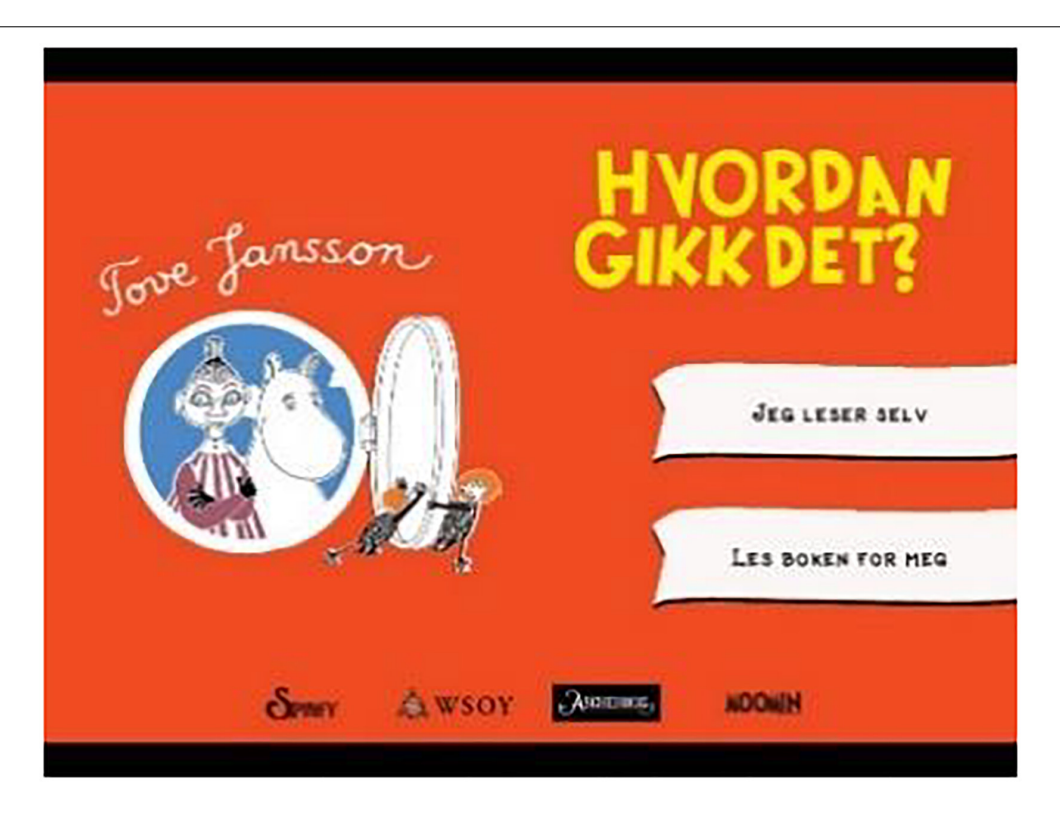
FIGURE 2 | Opening page of the app The Book about Moomin, Mymble and Little My.