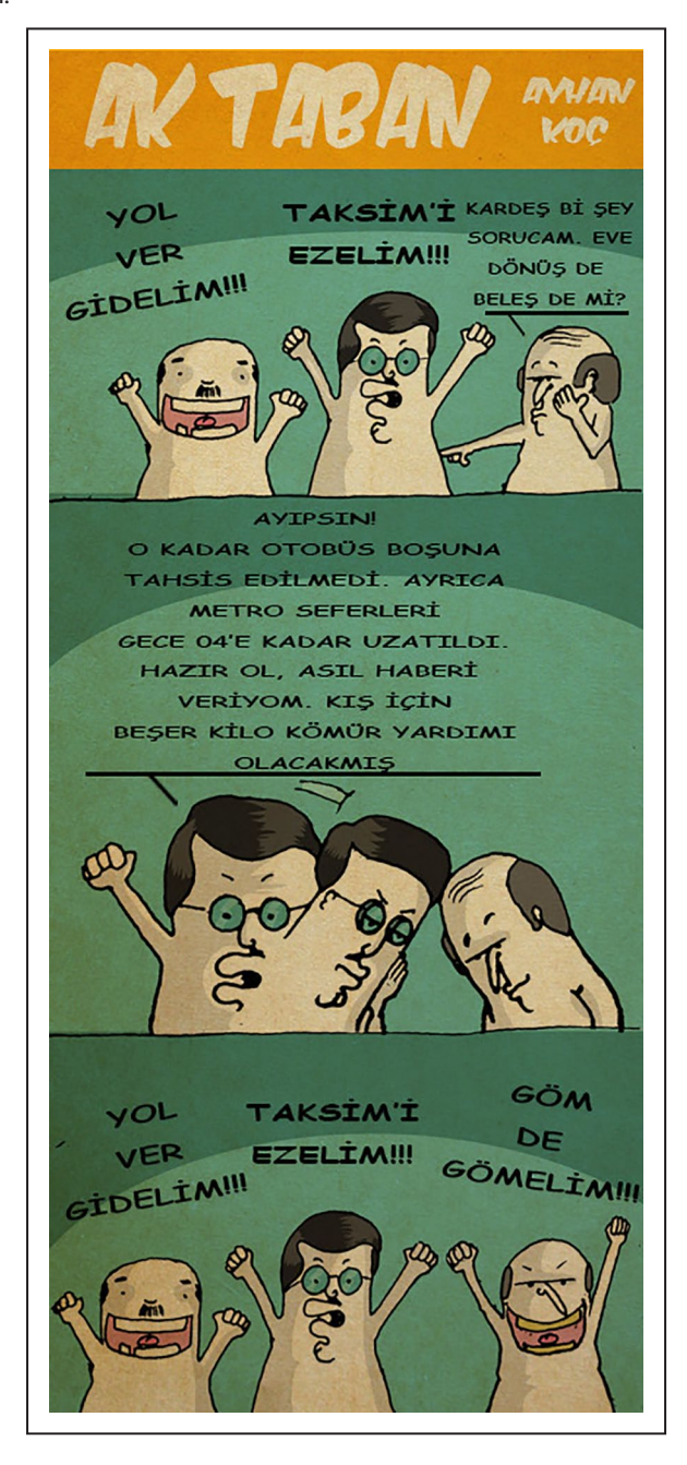
Figure 3. AK Taban.

the government provided free public transportation for its supporters in order to boost the visibility of the pro-government rallies held in Istanbul during the Gezi Park protests. It also refers to AKP's using in-kind assistance such as coal, wood or food items in order to co-opt supporters. The caricature is named AK Taban – the bedrock of AKP – in reference to AKP constituency.