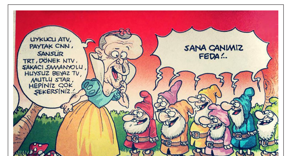
Figure 2. Erdoğan and the seven dwarfs.

'laughing together' (Demjén, 2014; Fraley and Aron, 2004). Furthermore, colloquialisms, phrases and expressions, what Olszewska (2005) called the 'New Speech' in the dissident Polish poet Baranczak's work, can also represent socio-political and cultural situations within authoritarian contexts. The principal aim of Baranczak's poetry was to speak the 'truth' about the political and social reality of the time. This new poetical expression incorporated exposing the language of propaganda by means of dissecting its structures, employing the linguistic concrete and situating the poem in the socio-political reality. In this kind of poetry, the official language was countered with irony and popular catchphrases, and used in order to draw the reader's attention to the fact that the language of propaganda is devoid of meaning (Olszewska, 2005: 18–22). Therefore, metaphors, colloquialisms, phrases and expression composed the essence of 'carnivalistic laughter' as Bakhtin (1984 in Häkkinen and Leppänen, 2013) indicated earlier. The truth that such carnivalistic laughter provides rebuked the authoritarian regimes from fostering their own truths. We present two instances (see Figures 2 and 3) how the activists reflected on common knowledge, planted metaphors, played with language and overall used humour to build audiences in support of their platforms during the Gezi Park protests.