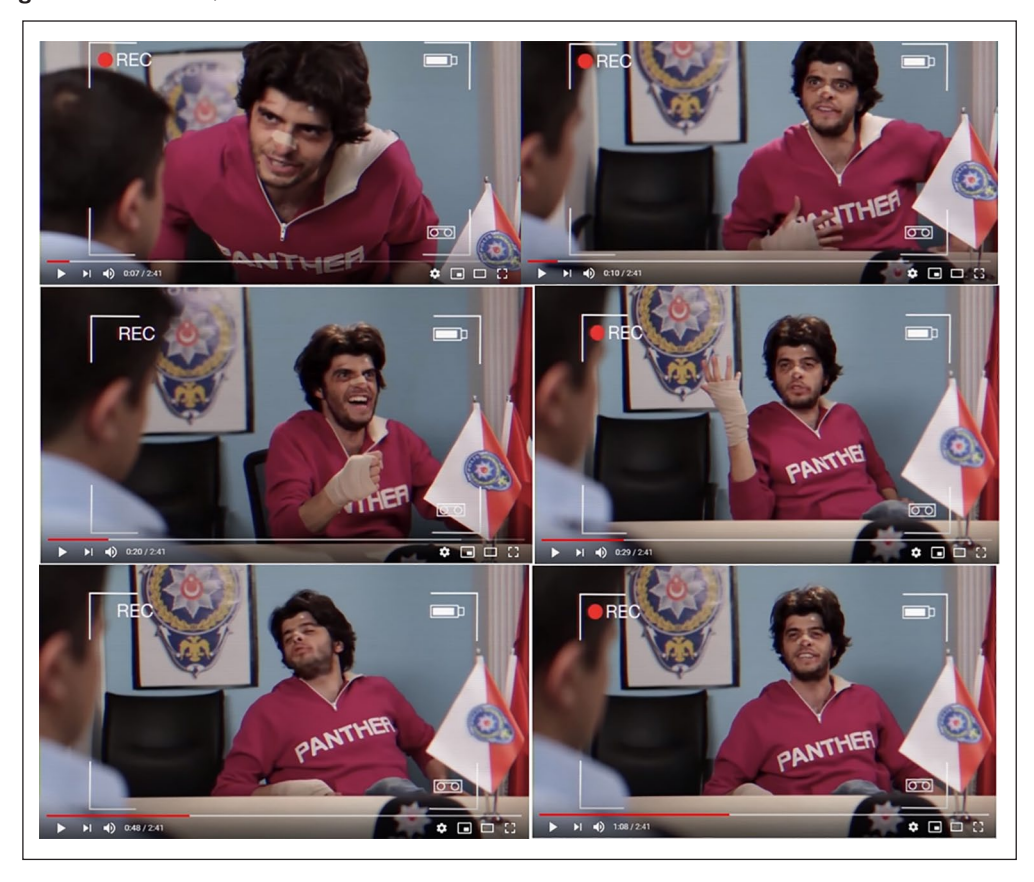
Figure 7. Gaz var mı, Gaz?

humour as this parody refers. This is what contextualises this video in the theatre of absurd. Turkish humour is replete with references to people finding themselves in situations at police stations following raucousness after a night out drinking alcohol or domestic violence. To being at a police station and its everyday quality — characterised by humour in this video, the activist introduces the pepper gas and presents it as a disturbance to the order of things. As in the earlier instances, rather than pacifying the activists, thereby, the pepper gas has activated him. After he saw the commotion at Gezi Park on Twitter and how the protestors were gassed, he says, he rushed to Gezi Park asking to be gassed. He adores gas and he is aware that his adoration metaphorically presents a threat to the status quo. In a nutshell, his simple movements of everyday gestures enrich his experience of the pepper gas and his protest as a result.