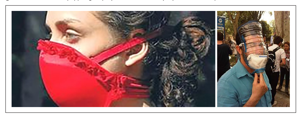
Figures 4 and 5. The pepper gas spray mask in the everyday of Gezi Park protest.

widely known and understood. While the government controlled mainstream news outlets, currents of dissent grew as Twitter and Facebook facilitated a better knowledge of what was happening in Gezi Park to the wider public.