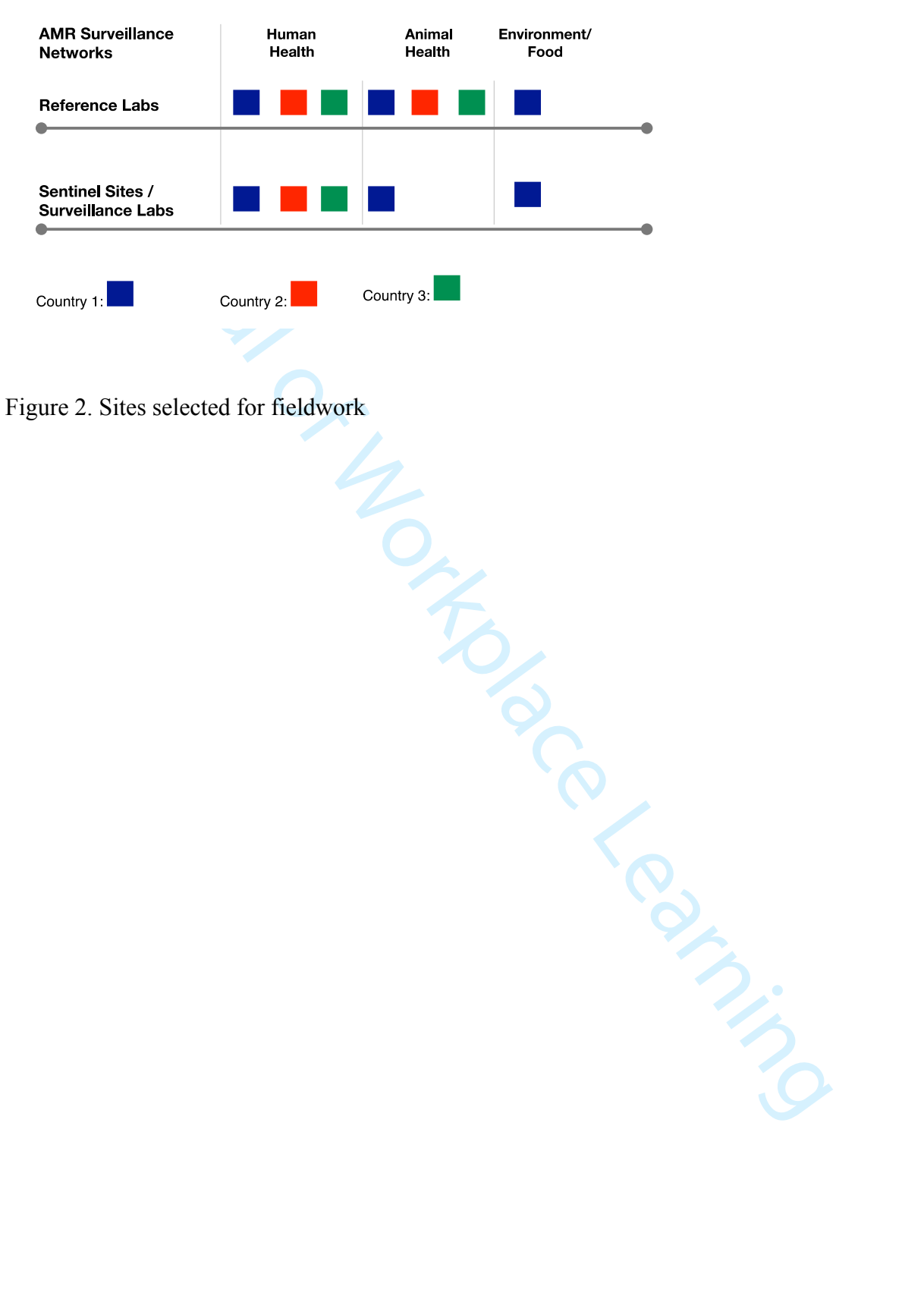
Figure 2. Sites selected for fieldwork