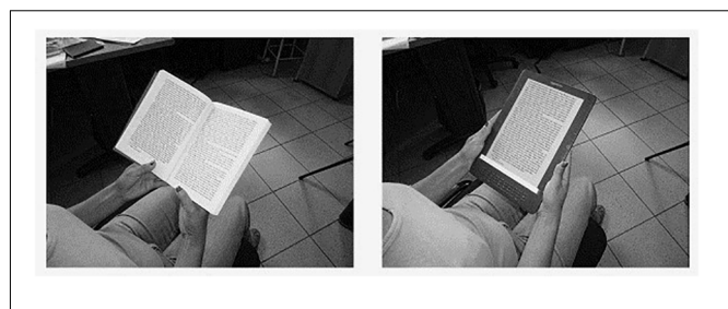
FIGURE 1 The print pocket book and the Kindle. The left-hand page in the print book corresponds to the page displayed on the Kindle.

<sup>a</sup>Number of books read per year: 0–3 books = 1; 3–5 books = 2; 5–10 books = 3; >10 books = 4. <sup>b</sup>E-reader familiarity: have never used a Kindle or similar device = 0, have occasionally used a Kindle or similar device = 1, have often used a Kindle or similar device = 2, always using a Kindle or similar device = 3.