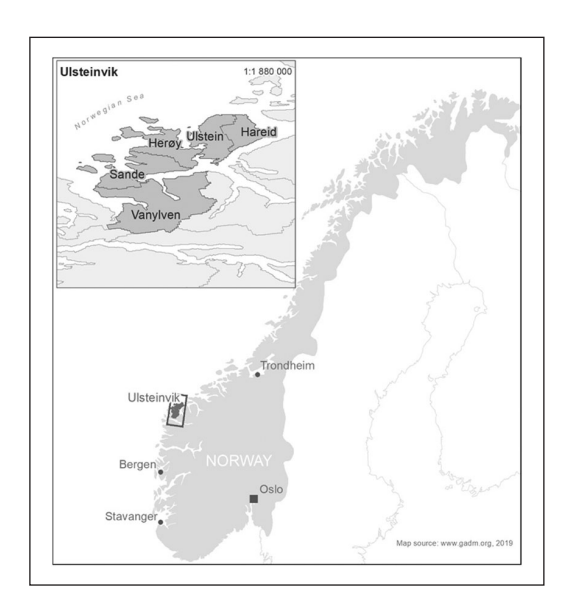
Figure 2. Geographic location of the study area.

The case study concerns a region in the coastal islands of the Sunnmøre district (Ulsteinvik labour market region), comprised of five municipalities (Ulstein, Hareid, Herøy, Sande and Vanylven) located in Møre and Romsdal County in the western