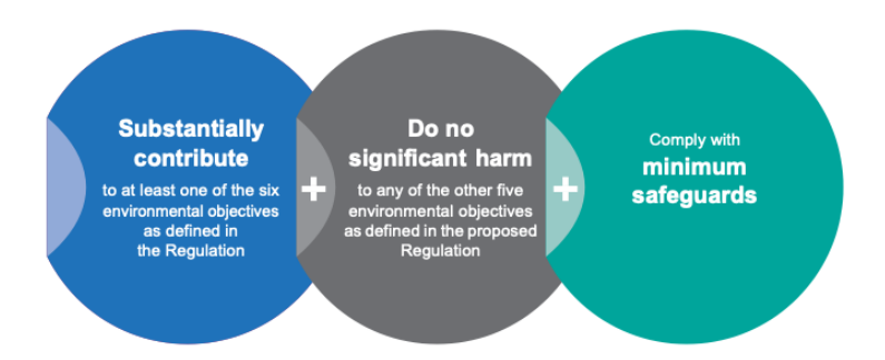
Figure 2 – Requirements for Environmentally Sustainable Activities

The taxonomy sets criteria for environmentally sustainable economic activities (EU TEG, 2020b). An economic activity is qualified as environmentally sustainable if it meets the requirements shown in Figure 2 (EU TEG, 2020b).