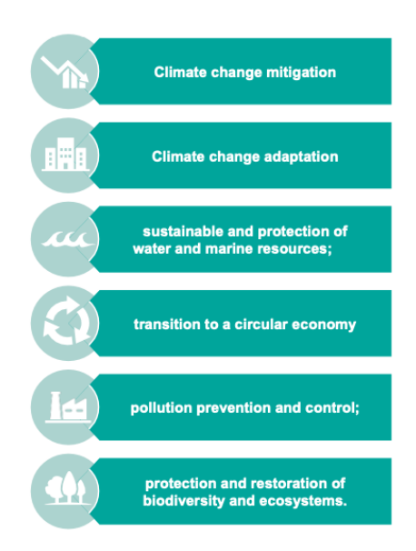
Figure 1 – Environmental Objectives in the Taxonomy Regulation

The EU taxonomy is one of the most notable developments in sustainable finance (EU TEG, 2020b). It will be significant for investors and issuers in the EU and beyond. The Taxonomy Regulation was agreed at the political level in December 2019. The Taxonomy Regulation creates a legal basis for the taxonomy and sets the framework and environmental objectives. In addition, the regulation sets out new legal obligations for financial market participants, large companies, the EU and the member states (EU TEG, 2020b). The regulation establishes criteria for determining whether an economic activity qualifies as environmentally sustainable, with the intention of determining the extent to which an investment is environmentally sustainable (European Union, 2020). The Taxonomy Regulation establishes six environmental objectives, shown in Figure 1 (EU TEG, 2020b).