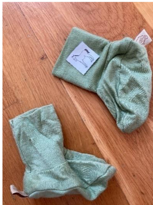
Figure 2. Activity of “matching and pairing socks”.