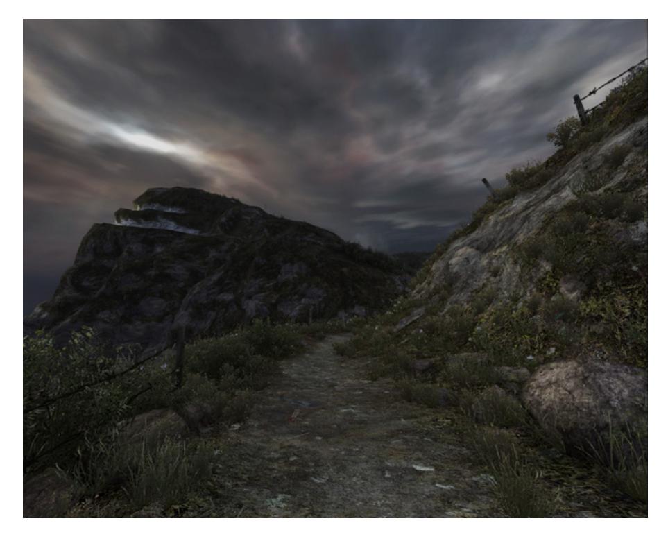
Figure 2. Screenshot from Dear Esther (The Chinese Room, 2012), captured by Finn Arne Jørgensen.

Dear Esther – originally from 2008, released commercially in 2012 – is often labelled as the first walking simulator. In the game, the player walks repeatedly along a path on an island (Figure 2), listening to audio fragments from people who lived on the island. With each playthrough – or walk across the island – new fragments appear and add up to a more detailed story that explains why the player is on this mysterious island. But there is no ultimate goal or end beyond the gradual immersion in a story, something which characterises walking simulators. There are no opponents, no fights, no challenges to overcome. Yet, Dear Esther differs from later walking simulators in that there is less room for individual explorations. The game takes place along the path, in a linear fashion, with very little interaction with the game world itself. Even