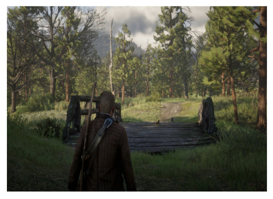
Figure 4. Screenshot from Red Dead Redemption 2 (Rockstar Games, 2019).

deep knowledge of and connection to the game world. A recent survey found that playing Red Dead Redemption 2 increased players' knowledge of animal behaviours and interspecies interactions, as well as improving their ability to identify wildlife.<sup>17</sup> These connections are built through movement and experience of place.