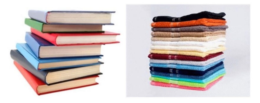
Figure 2. Example of a reading picture and matched neutral picture in the Picture Evaluation Task.

We used a title recognition list as an indicator of familiarity with books (see Study 1). To prevent a testing effect, we developed two versions. Half of the students made version A at pre-test and version B at post-test and the other half vice versa. Both contained 34 existing titles, appropriate for the students' age range, and 16 fake