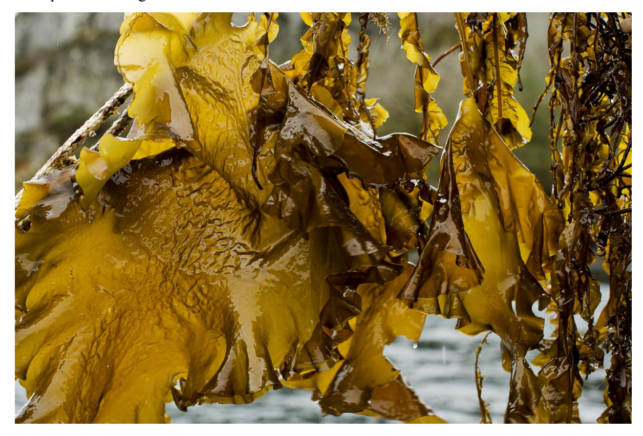
Figure. 5 Kelp on rope for testing growth outside Atctic Seaweed locations in Øygarden.

By this Orkla Ocean help secure funding for further development and a market for the raw material. The informant from Arctic Seaweed believes that when others see that Orkla enters the early phase, it will change and increase the attractiveness of investing in kelp companies. "With Orkla Ocean as a customer, gives a positive signal to the entire industry. They give us confidence that we can get sales on the volumes we make. It gives us a clearer direction of our business". This informant also sees more willingness to invest in the industry now, but the development is expensive, so he hopes the large capital will come in in the future. If the industry shall be able to produce on a large scale, capital will be needed. The Norwegian Seaweed Association sees that many small growing companies have problems getting investors, but some say money is not an issue, and the informant does not see any calling for more public funding.