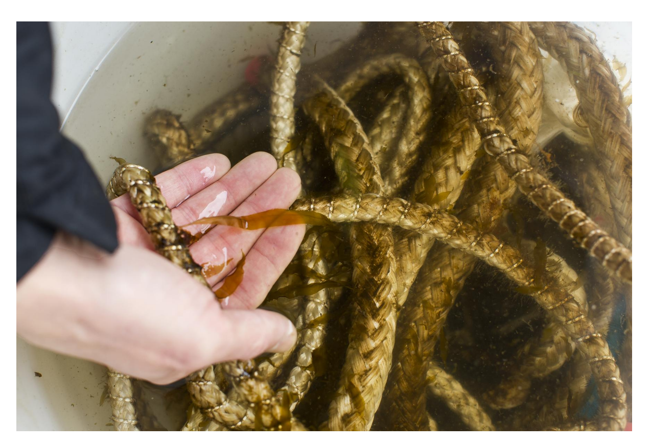
Fig. 1 Seeding on rope on the production site of Arctic Seaweed.

Mtons globally in 2016, according to FAO (2019). Most of this production is still dominated by Asian countries, which account for 99,4% of the quantity produced (Barbier et al., 2019).