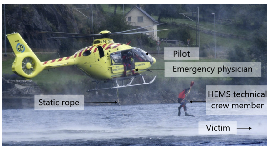
Figure 1. Ihopp: the primary static rope over water procedure in Norwegian HEMS.

Missions reported as physically demanding were registered to provide insight into the physical requirements of static rope missions. Medical treatment given on-site by the HEMS technical crew member, registered in NOLAS, was also quantified.