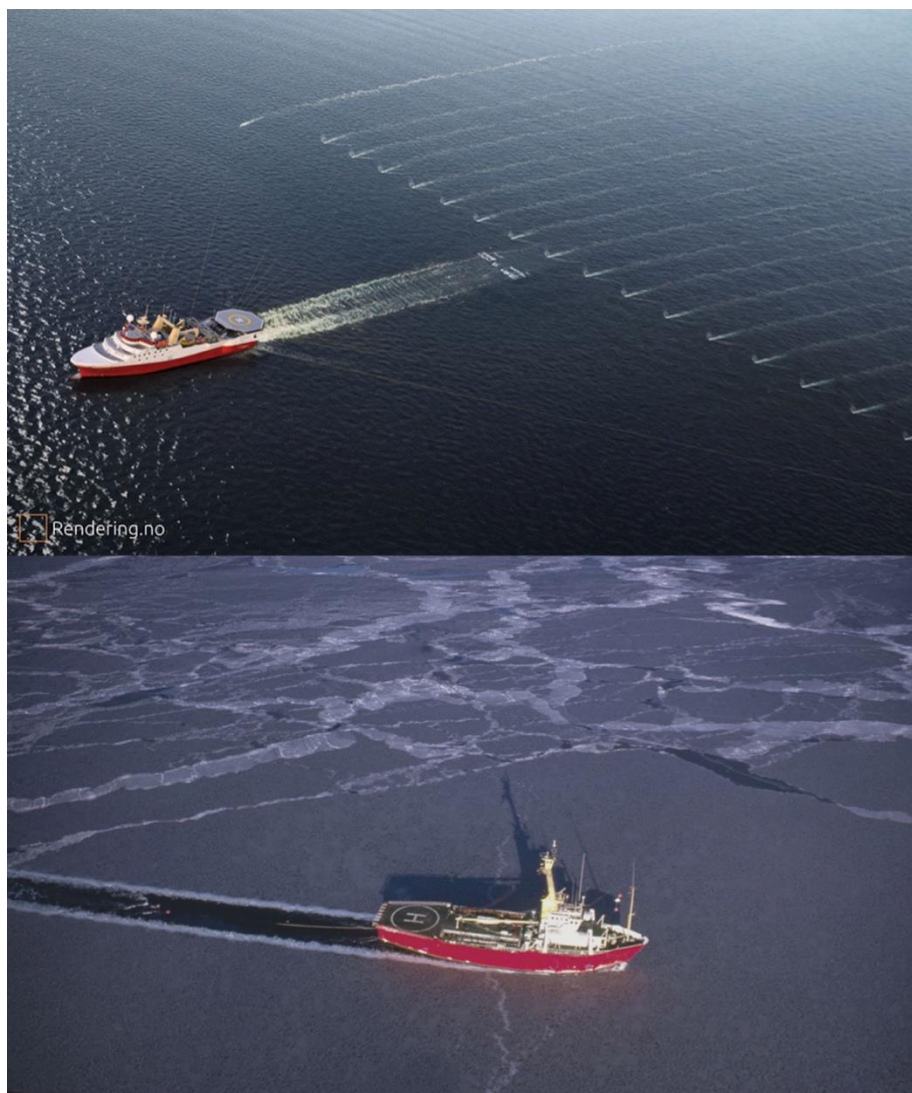
Figure 1: Seismic acquisition offshore a) normal sea conditions b) in areas with surface ice

Surface ice has a severe effect on sound waves, and alterations caused by the ice generate inaccurate subsurface images. Seismic data acquisition in ice conditions (Figure 1) requires a reconsideration of the whole workflow of the conventional process i.e., movement of streamers under the ice in water for offshore exploration (Rypdal et al. 2012, Tomashin and Gorbachev 2013).