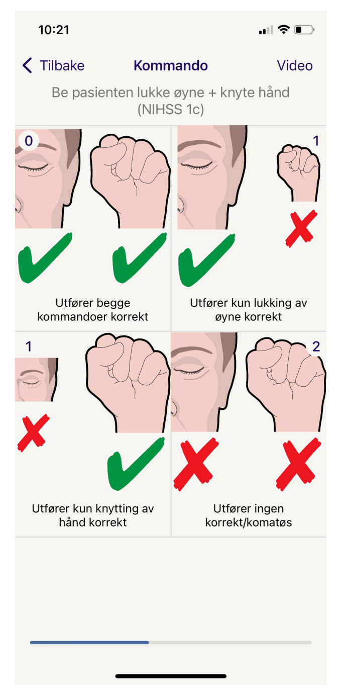
Figure 1 Level of consciousness command 1c as shown in application. NIHSS, National Institutes of Health Stroke Scale.