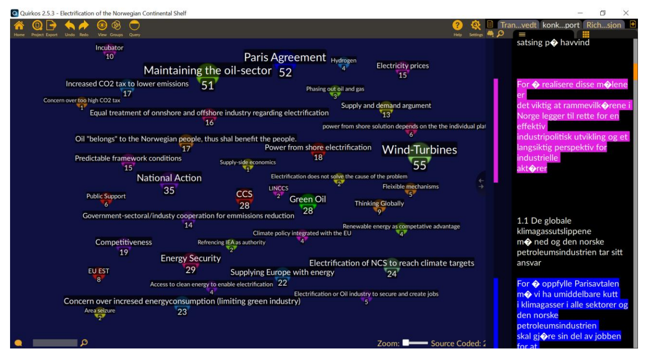
Figure 4. Screenshot from Quirkos-Konkraft report.

Figure 4 depicts a screenshot of the Quirkos program (the number under the names of the codes, are the number of "hits" totally from all documents). As one can deduct from looking through the codes, many of them are overlapping, or at least talking about bordering themes. One should also note that the number of hits each code has, should not be given too much meaning, as one would have done in a quantitative analysis, because in our interviews, our questions will "lead" the interview subject to talk about a lot of these codes. I.e, one of our questions was, if the interview subject could think of other alternatives of electrification. And this leads them in most cases to talk about CCS. So, then the CCS code got a high number of "hits" from most interview subjects, even though most of them did not think of CCS as their primary solution to electrification.