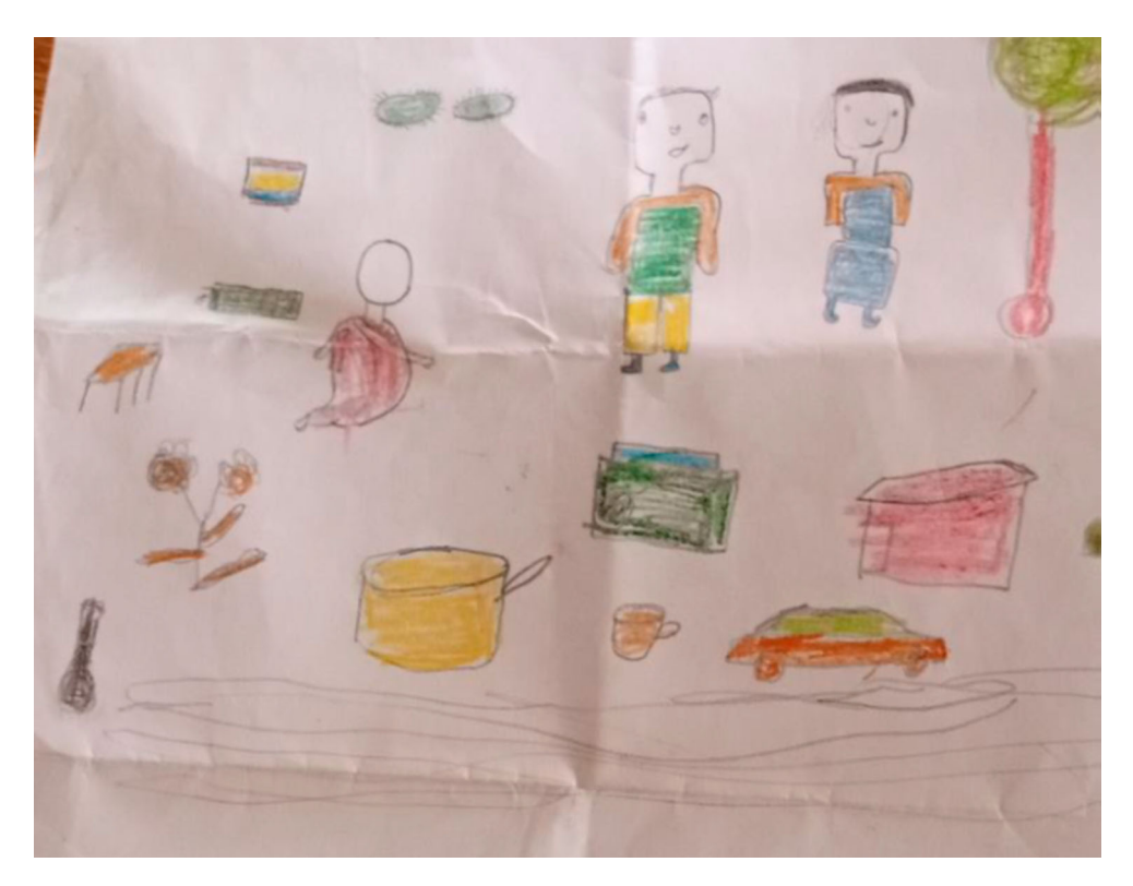
Figure 1. Children's original drawings.