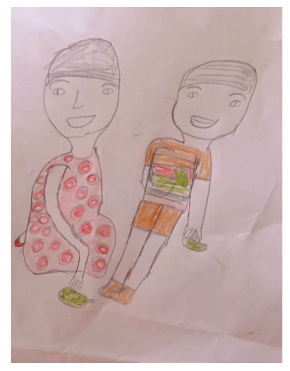
Figure 2. Children's original drawings.

Children's perceptions of who they are in the stories and in real-life contexts, and what they are allowed to do based on age or gender categories, were discernible in their recollections of the story read in the classroom. These recollections reflected child's agency as restricted by age and gender.