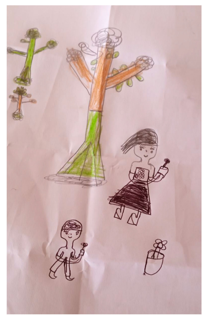
Figure 5. Children's original drawings.

Age-appropriateness was also commented on in terms of the book's texture, or physical qualities: