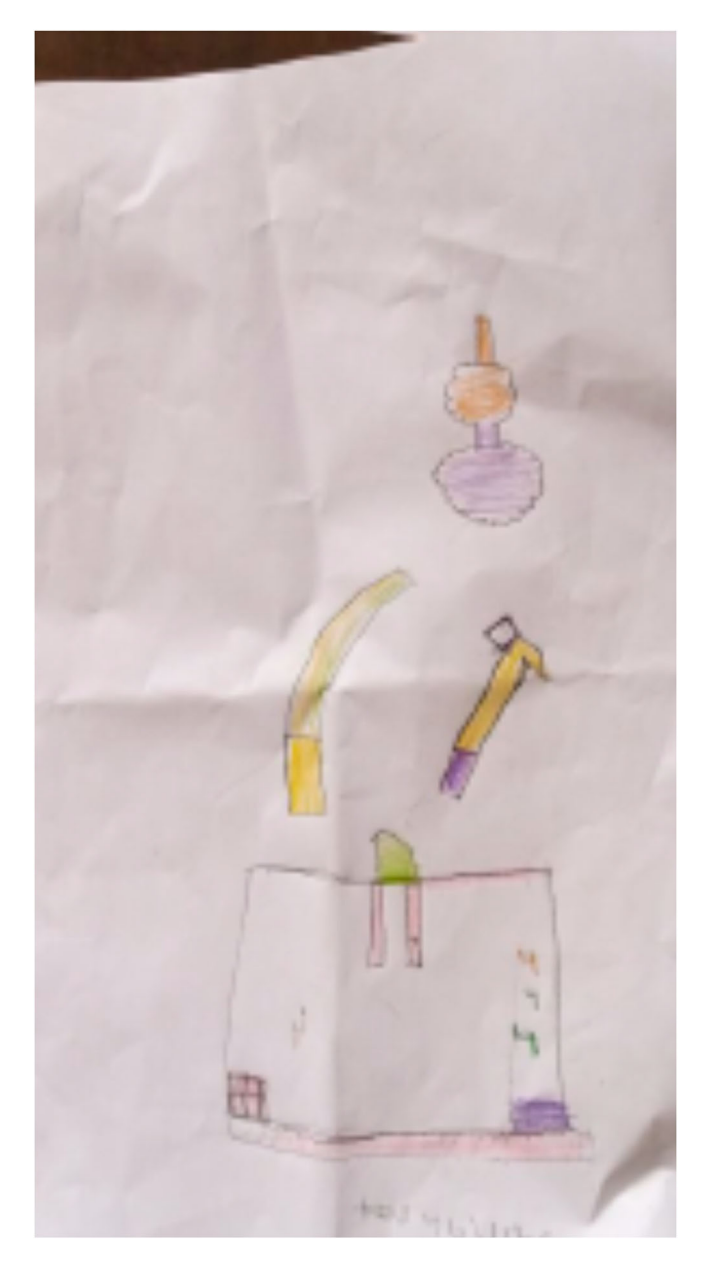
Figure 6. Children's original drawings.

I feel that it would matter how the book felt to the touch because if it's too course to the touch maybe they would not like it and if it were too soft ... say like those of the bible or newspaper, it would be too delicate for them to handle. (Teacher 2)